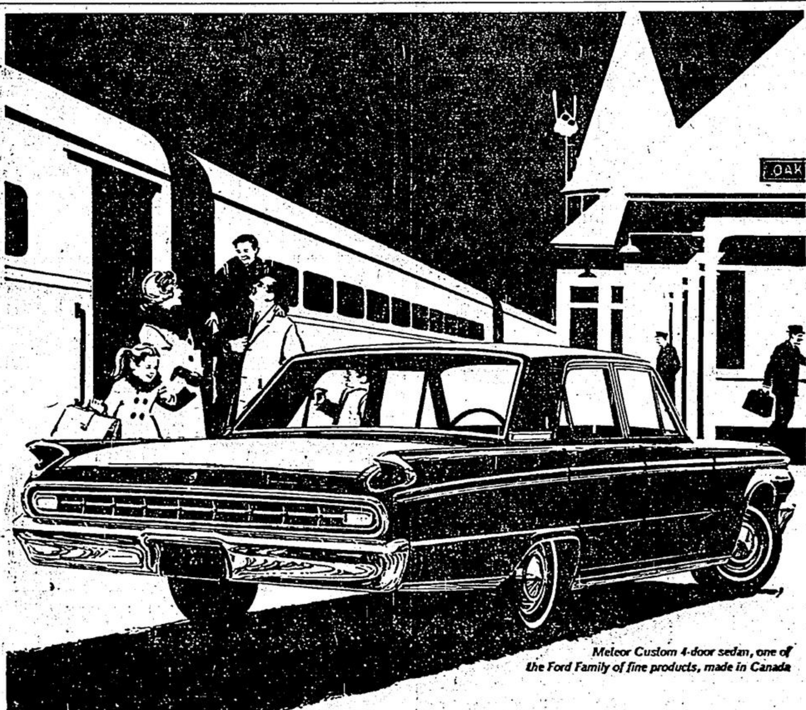
Meteor Custom 4-door sedan, one of the Ford Family of fine products, made in Canada