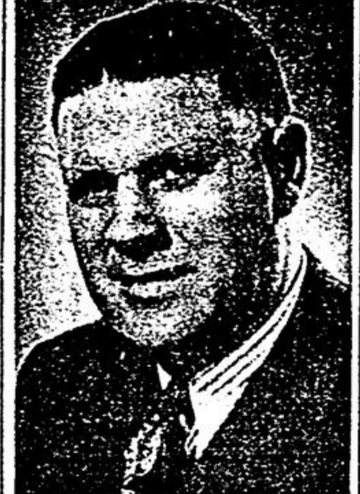
"for the kids"