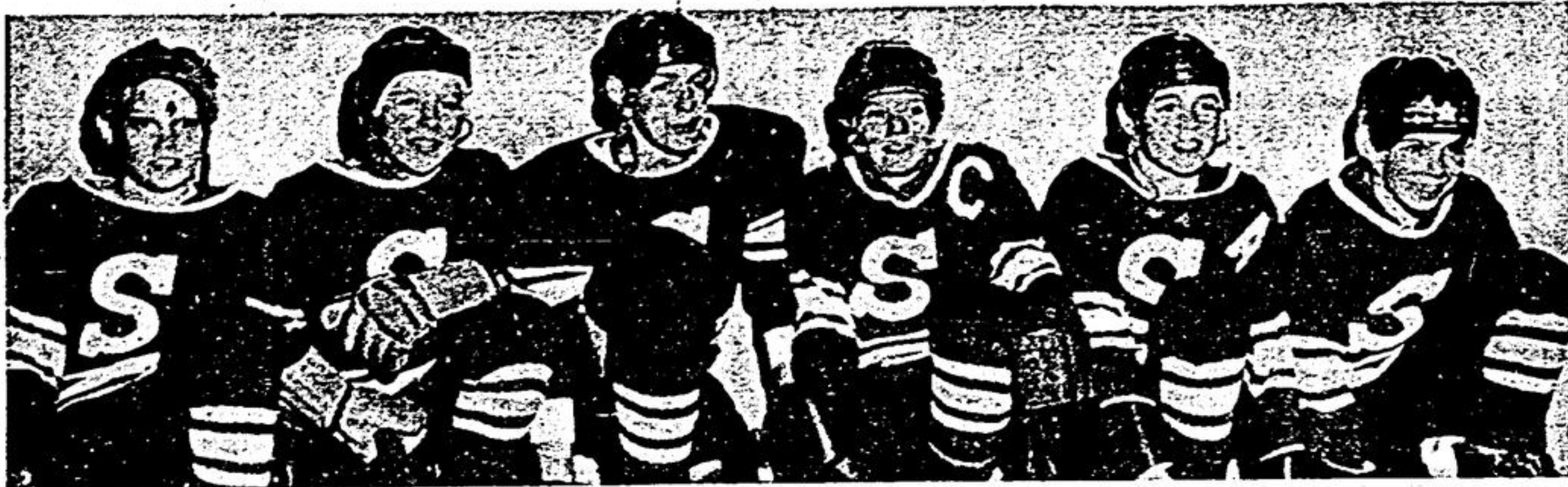
Stouffville's fine young peewee team will be one of nineteen local entries that will see action during Minor Hockey Week, Jan. 28 to 31. Club members, pictured here