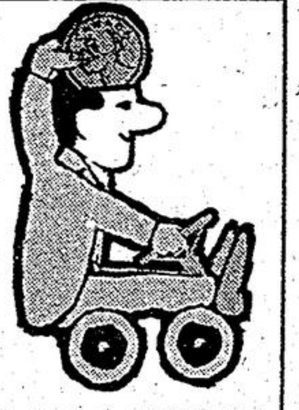
Use your head—and SAVE! Check State Farm's low insurance rates for careful drivers—rates so low that one out of two may save important dollars. Call today!