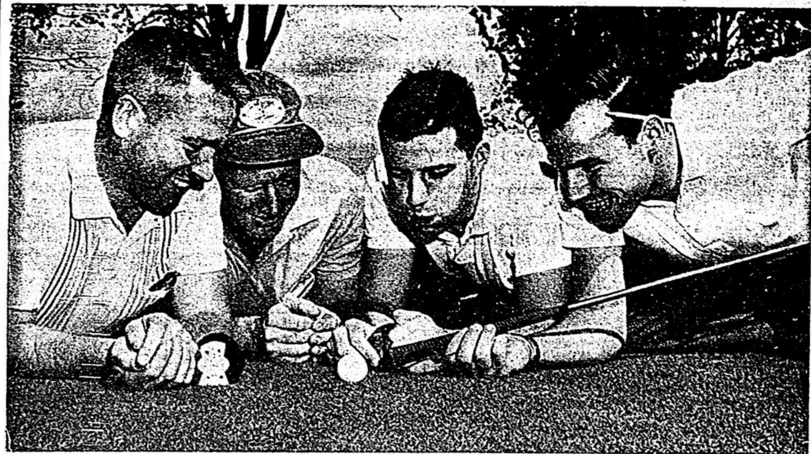
There was some good and some bad golf played in the 4th annual Invitational Tournament at the Willows Golf and Country Club on Saturday but this foursome appears to have exhausted their patience. Left to right—