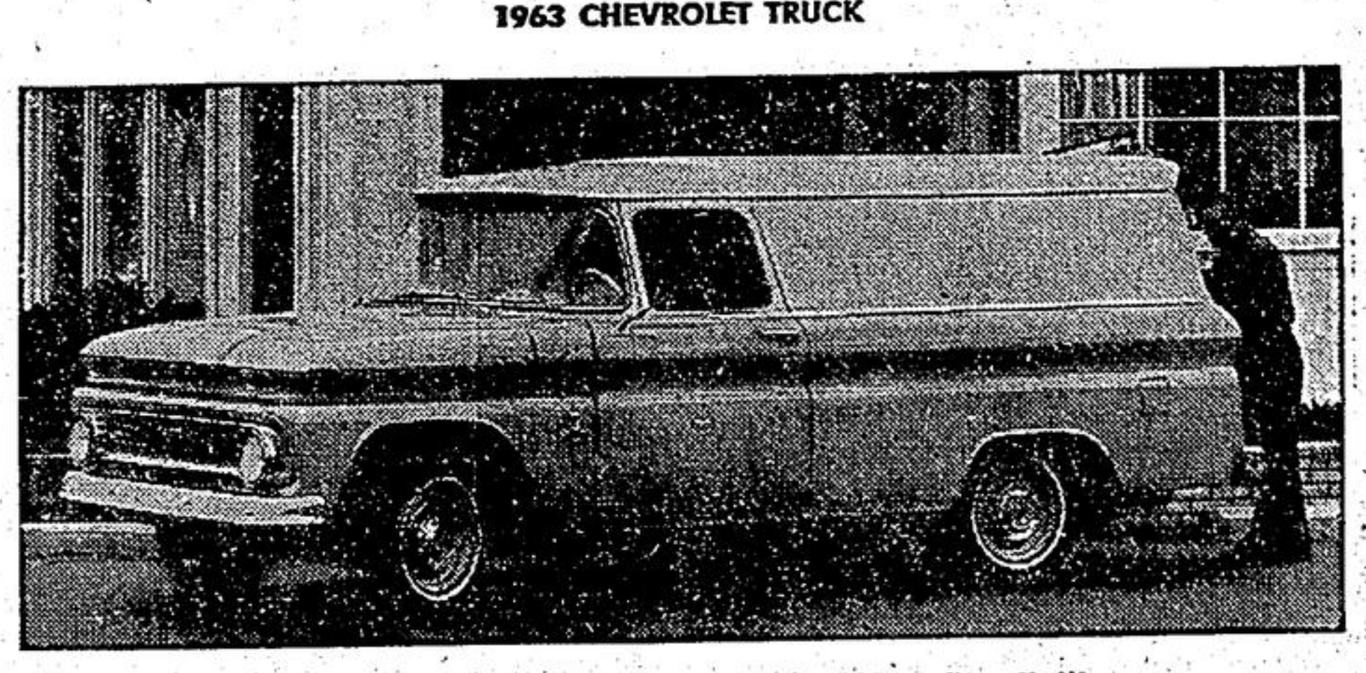
1963 CHEVROLET TRUCK Coming soon to Giles Chev.-Olds., Stouffville.