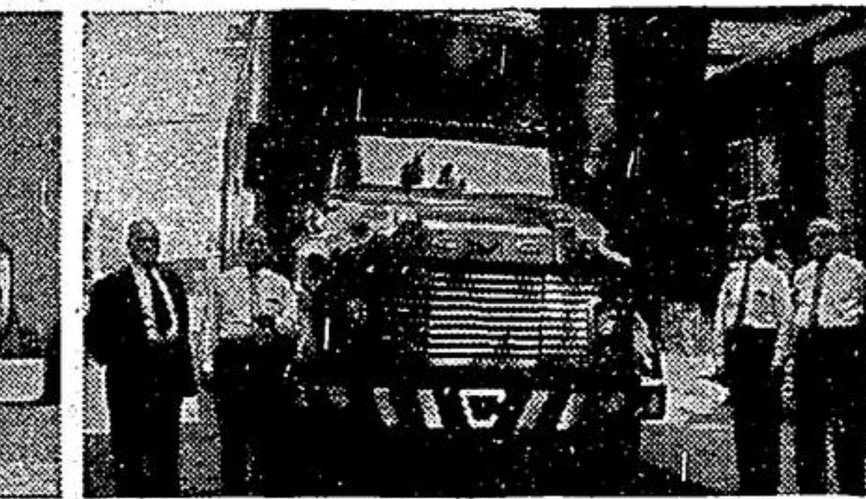
Power Bonus pays off for H. Corby Distillery, Corbyville, Ont.