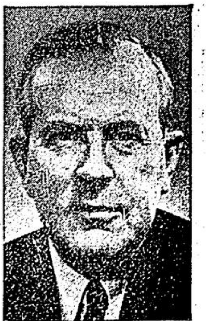
THE HON. L. B. PEARSON Leader of the National Liberal Party