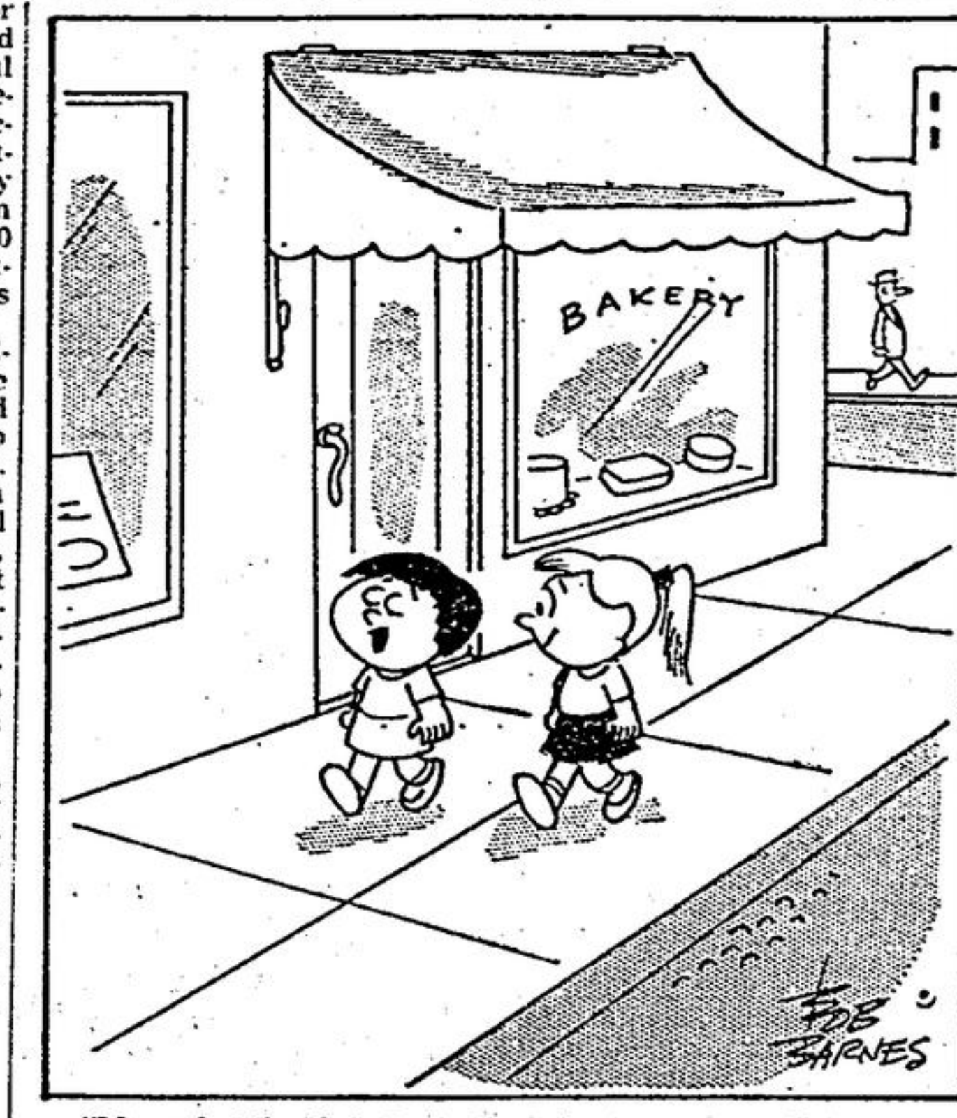
"I know just the kind of man I'm going to marry... He's going to be tall and handsome with a good job, and just love hop-scotch."