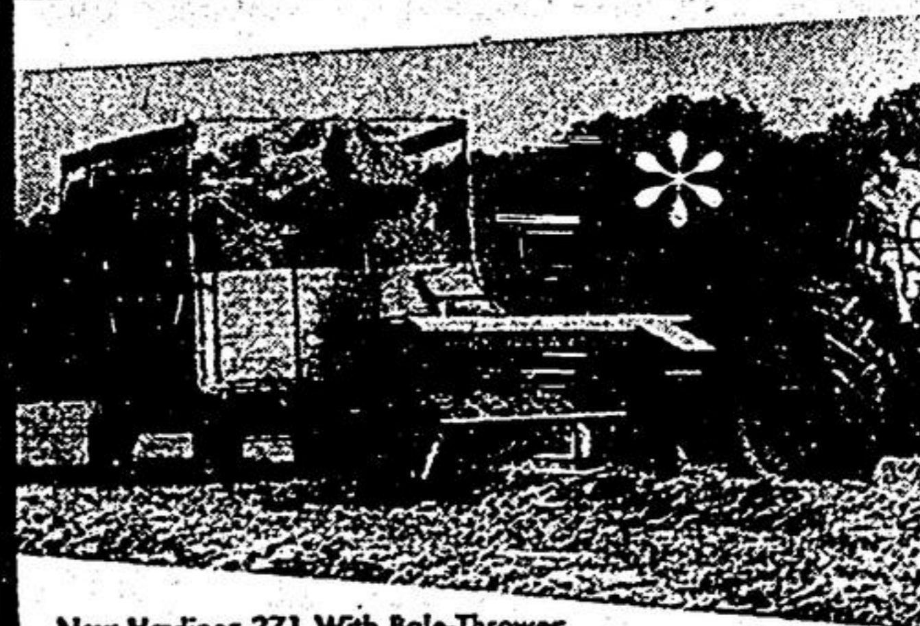
New Hayliner 271 With Bale-Thrower

This is the year for you to get the savings of One-Man Haying. Take the heave out of haying with any of five new 1962 Hayliner balers with Bale-Thrower. There's a system to match your farm, regardless of how big or how small. Up to 17 new design features on this year's great Hayliners, including improved Flow-Action feeding, adjustable feeder back, many others. Drop in today for the exciting details!