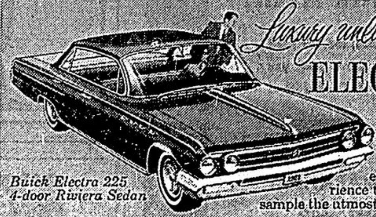
Buick Electra 225 4-door Riviera Sedan

happy medium size Buick now in a convertible Here's light-hearted beauty with all the flair. It's the tops—try it!