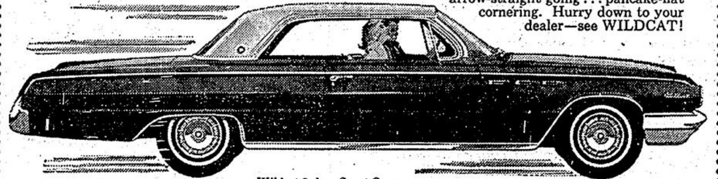
Wildcat 2-door Sport Coupe

Now! Buick combines the thrill of sports car zip with the comfort of fine-car luxury in this new addition to the Invicta series. WILDCAT! With exclusive Advanced Thrust. Buick gives you arrow-straight going... pancake-flat cornering. Hurry down to your dealer—see WILDCAT!