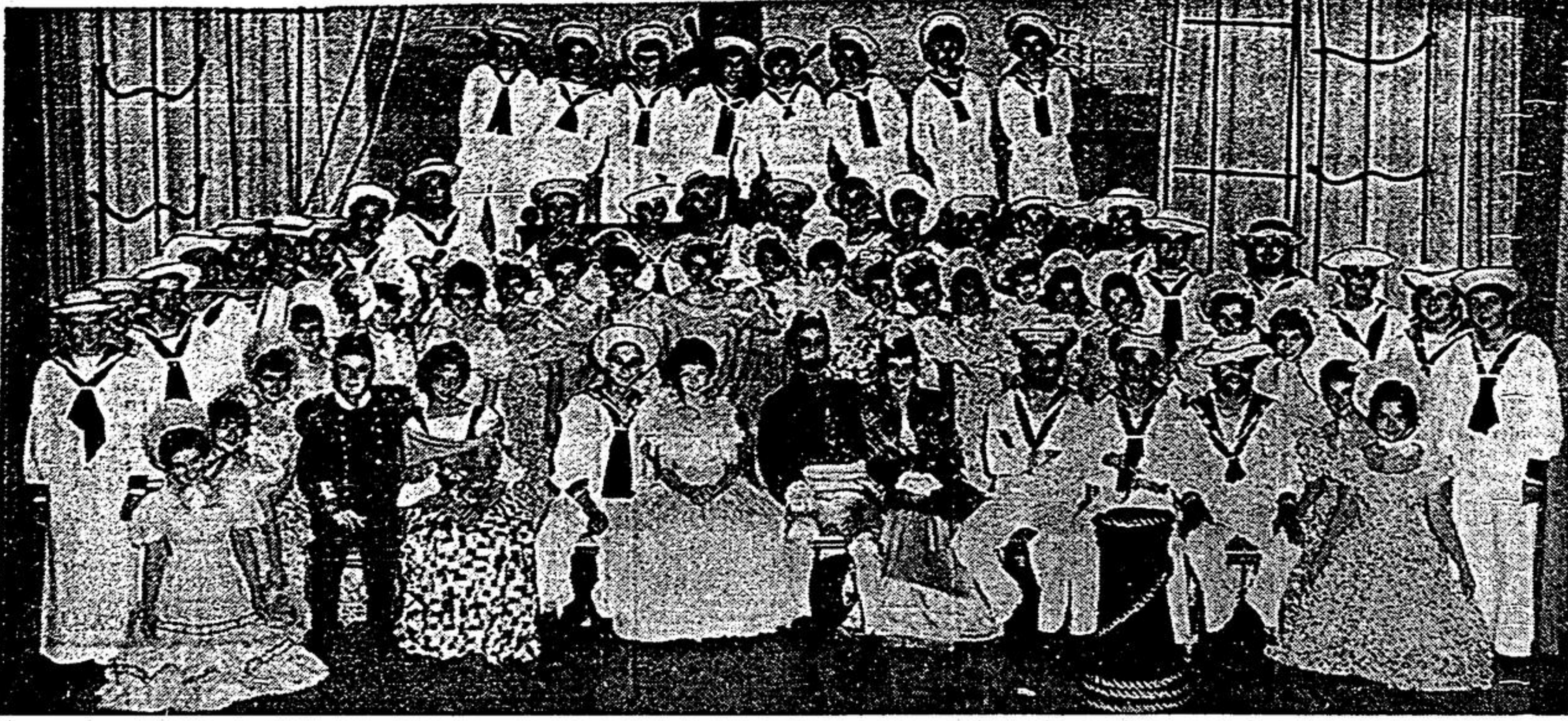
This panoramic view of the colourfull sixty-member cast of the Gilbert and Sullivan operetta H.M.S. Pinafore last week in the auditorium of the Stouffville District High School, is captured here through the camera lens of Cadieux. The program was on both Friday and Saturday nights.