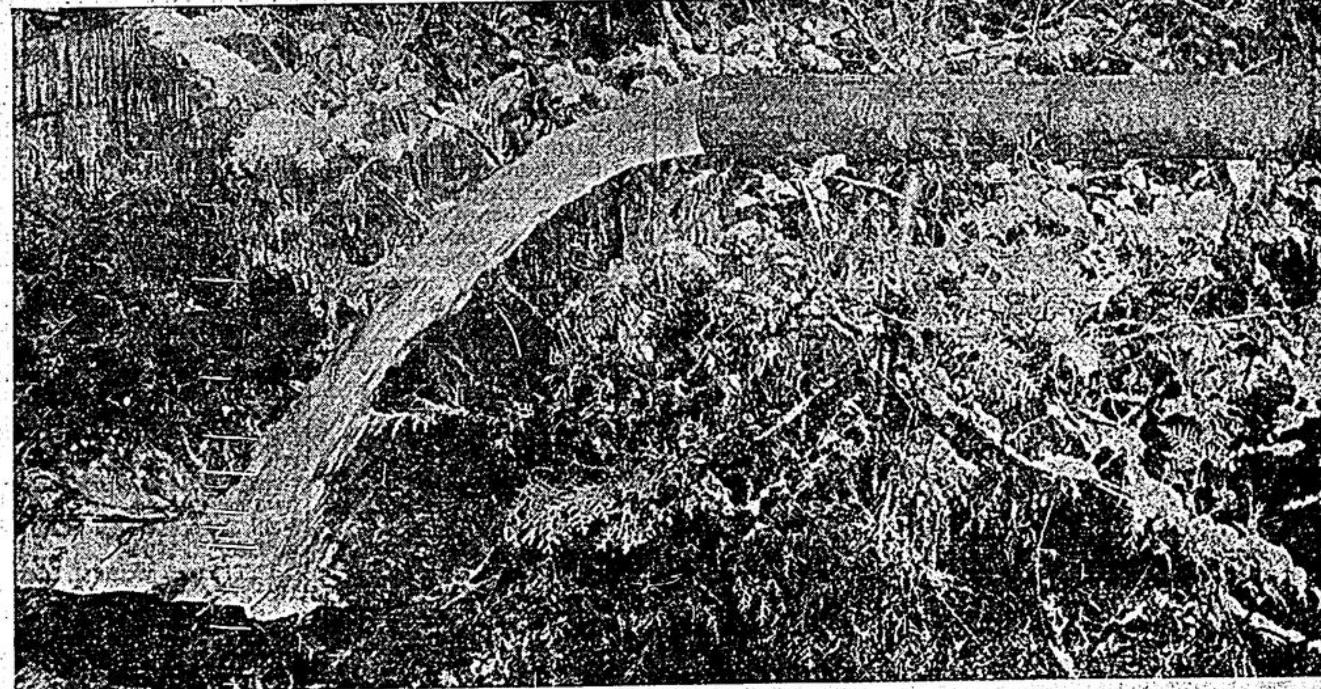
Wildcat Well at Baker Hill