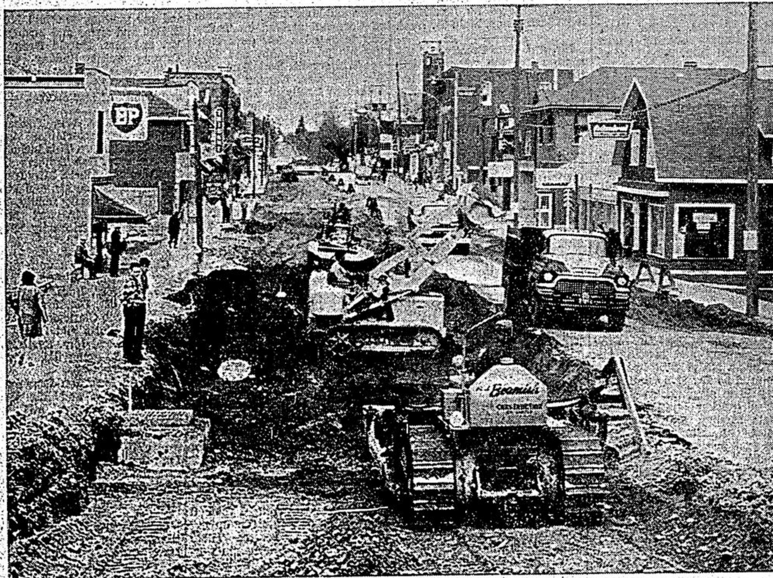
Main Street Pavement Construction