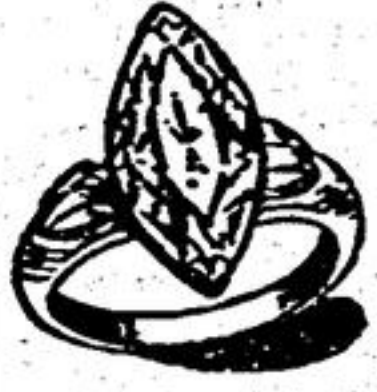
LADIES STONE RING $17.50