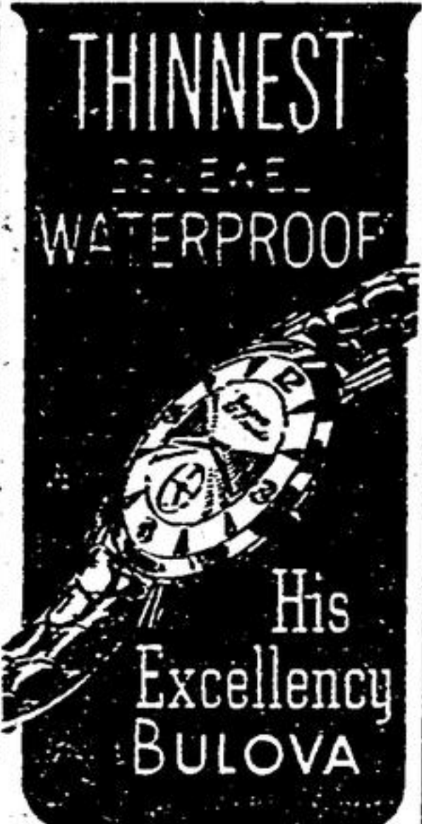
THINNEST His Excellency BULOVA from $59.50