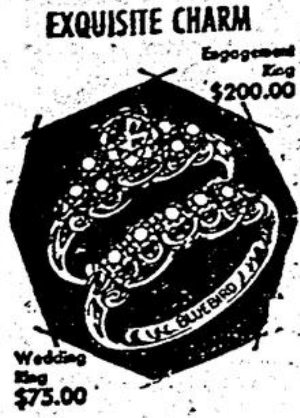
EXQUISITE CHARM Engagement Ring $200.00