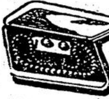
Cultured Pearls FROM $19.95