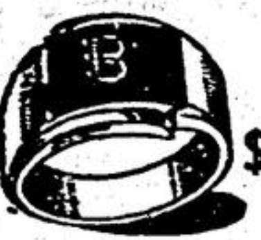
HEW'S SIGNET RING $30.00