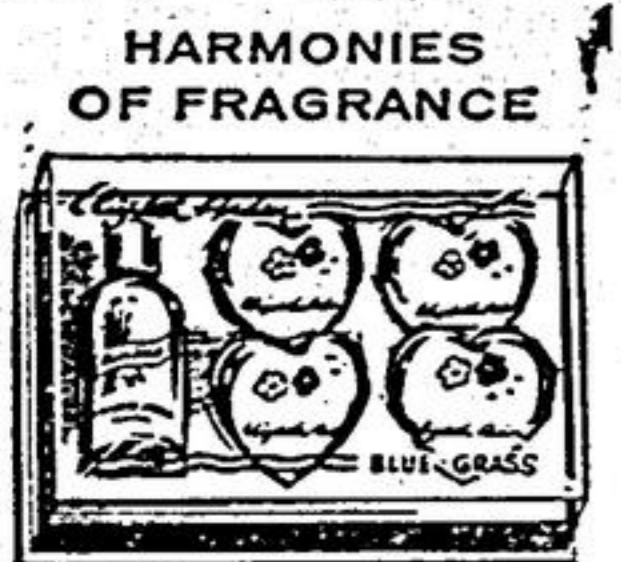
Heart-Shape Soaps (4) and Blue Grass Flower Mist (1 oz) make a pretty pair. $2.25

Christmas is coming with gifts from Elizabeth Arden