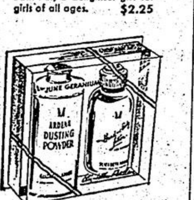
Travel-Pak Dusting Powder and Hand and Body Lotion in a symphony of June Geranium. $2.75