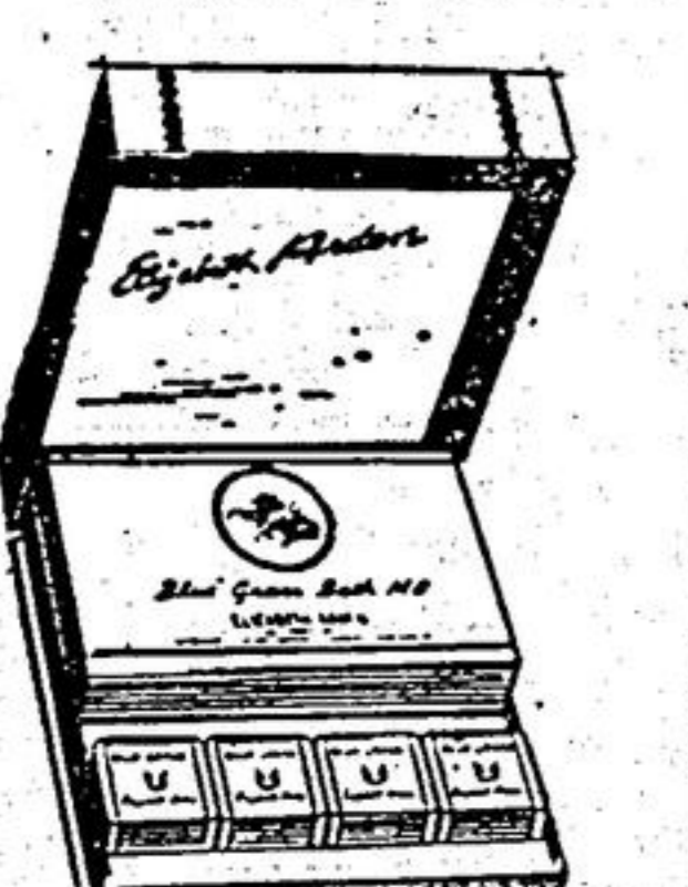
Blue Grass Bath Cubes (4) and Bath Milt, a delightful gift for girls of all ages. $2.25