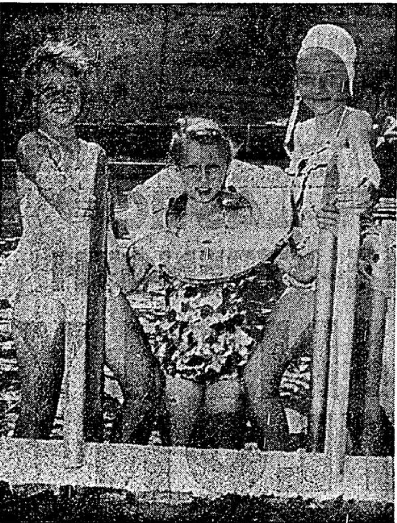
Three pretty Claremont hour training session. They mermaids are pictured here on the edge of the open air pool after completing a one-