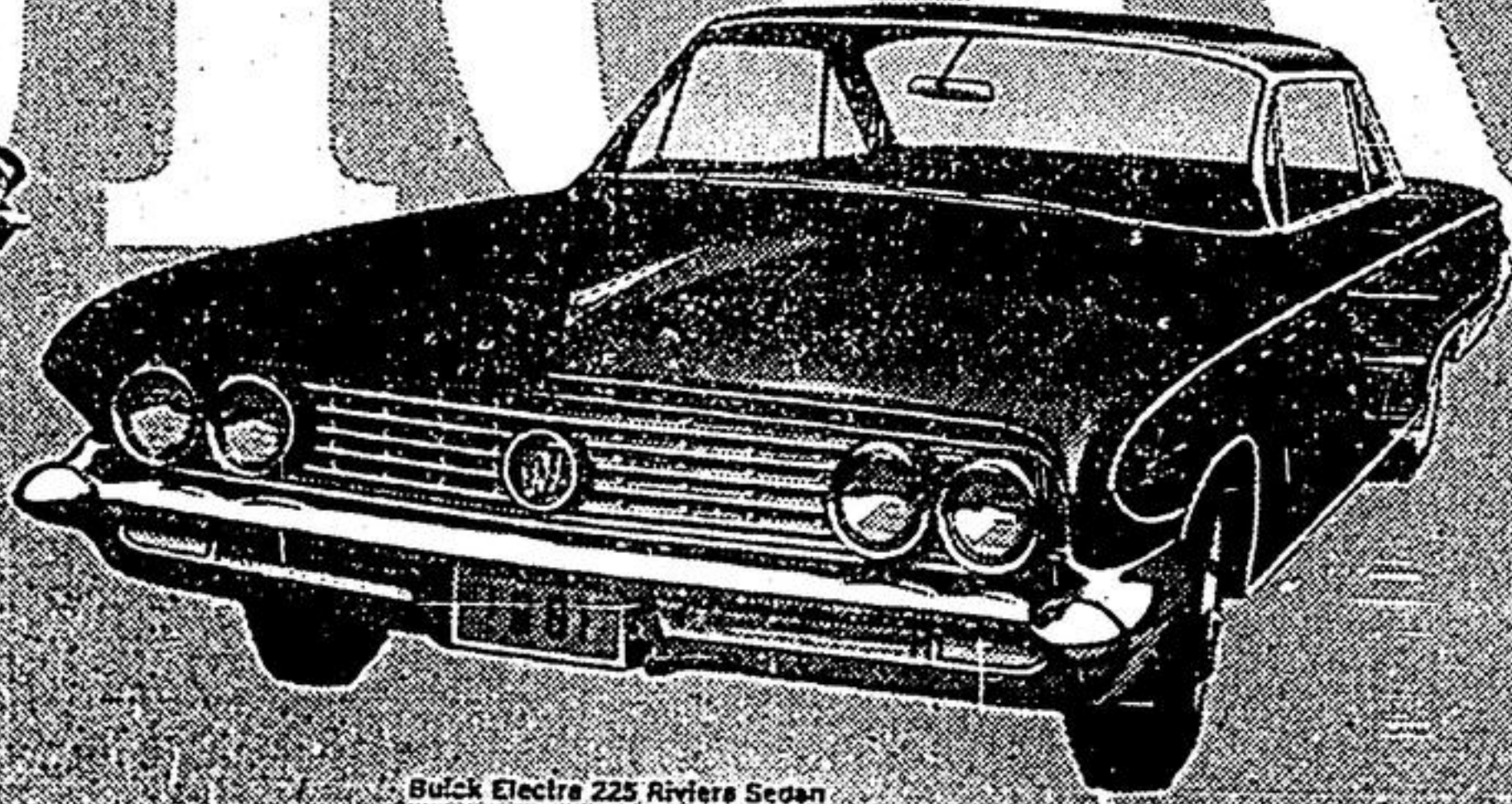
Buick Electra 225 Riviera Sedan

The very name, Buick, stands alone. All in one word, all in one car, qualities that are unequalled in excellence. Flawless performance... incomparable beauty matched to superlative craftsmanship... unsurpassed prestige and reliability... this is Buick! Selecting your Buick is a very pleasant task indeed — with 22 individual models to choose from. Yours in three distinctive series... Electra, Invicta and Le Sabre — plus the trim Buick Special models which include the spanking new Skylark, shown above. Experience for yourself Buick's traditional qualities — at your quality Buick dealers today!