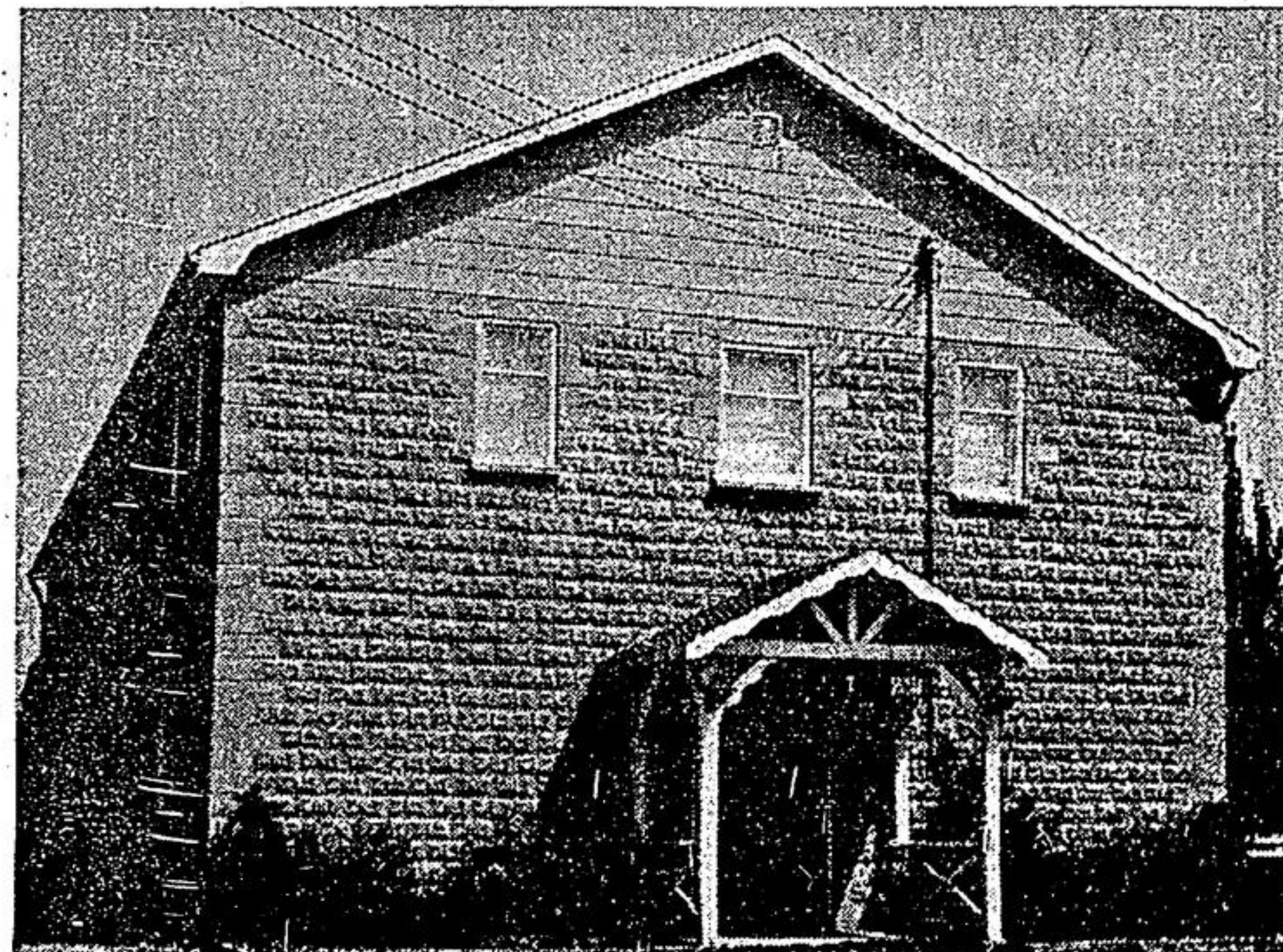
Richardson Masonic Lodge 100 Years Old