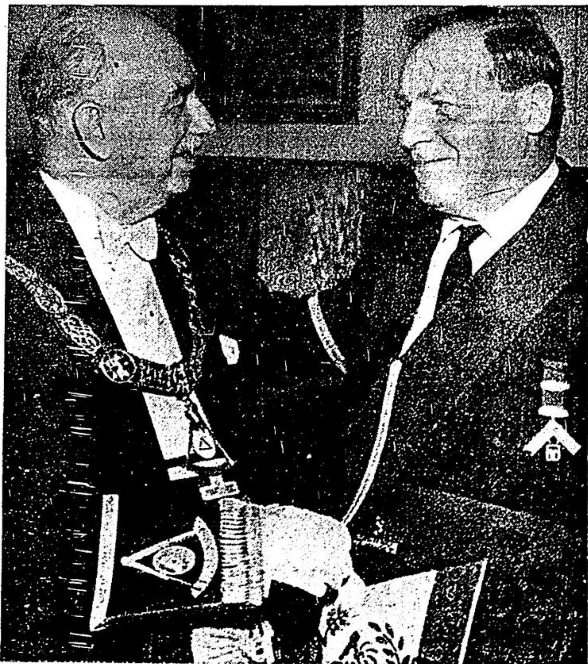
Local Mason Joins Grand Lodge