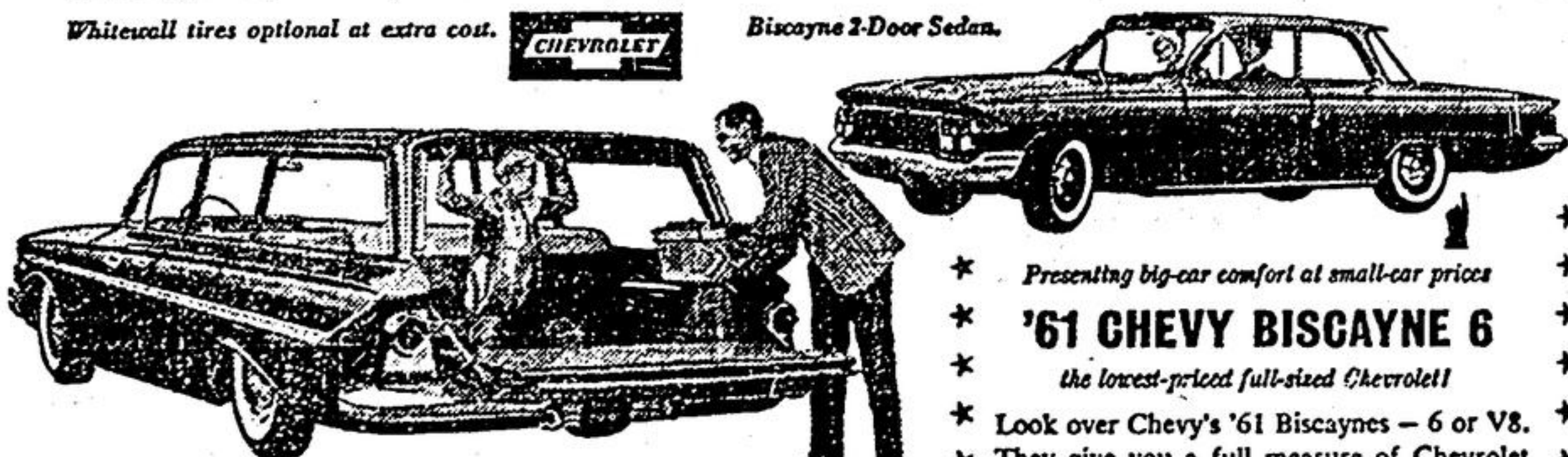
Parkwood 9-Passenger Station Wagon. One of 6 easier loading Chevy wagons. All feature a new concealed compartment under the floor.

See the new Chevrolet cars at your local authorized Chevrolet dealer's