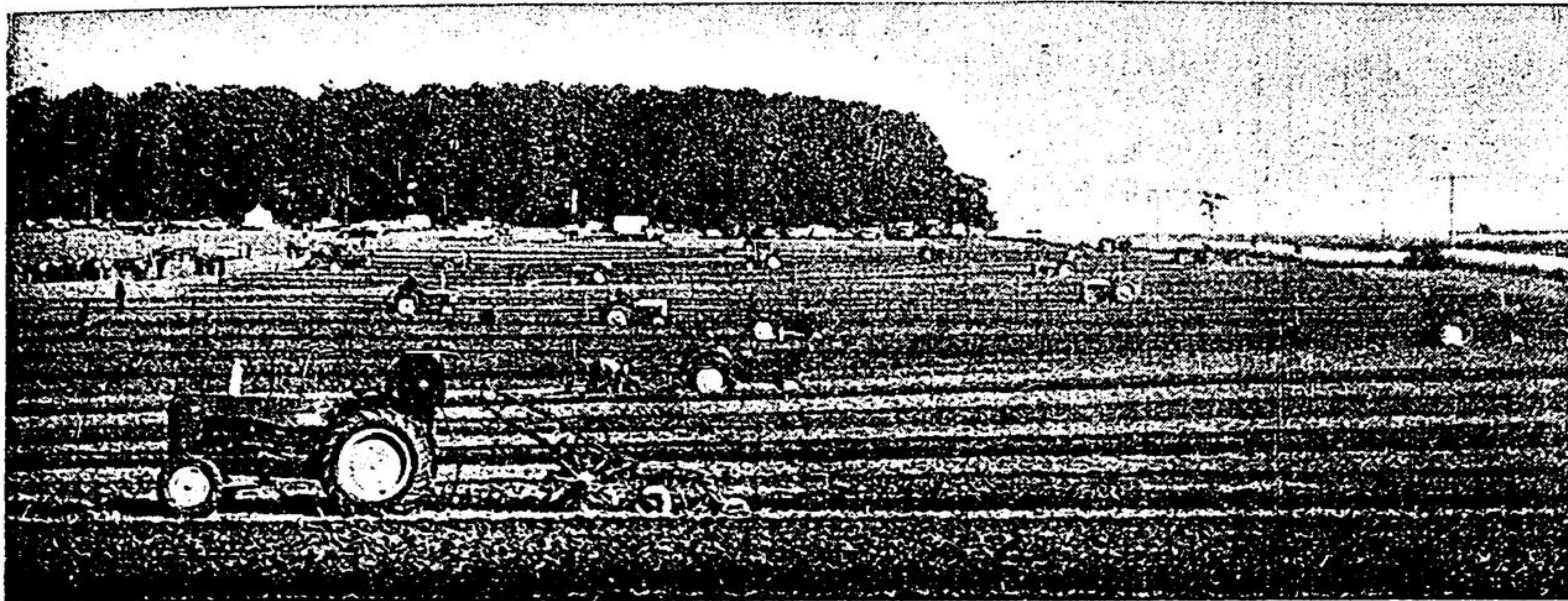
A wide-angle view of the North York Plowing Match as seen through the lens of the Tribune camera depicts a total of sixteen tractors in the heat of competition on the farm of Harry Walker, two miles east of Newmarket. Weather and land conditions were ideal for the match that attracted 32 individual entries.