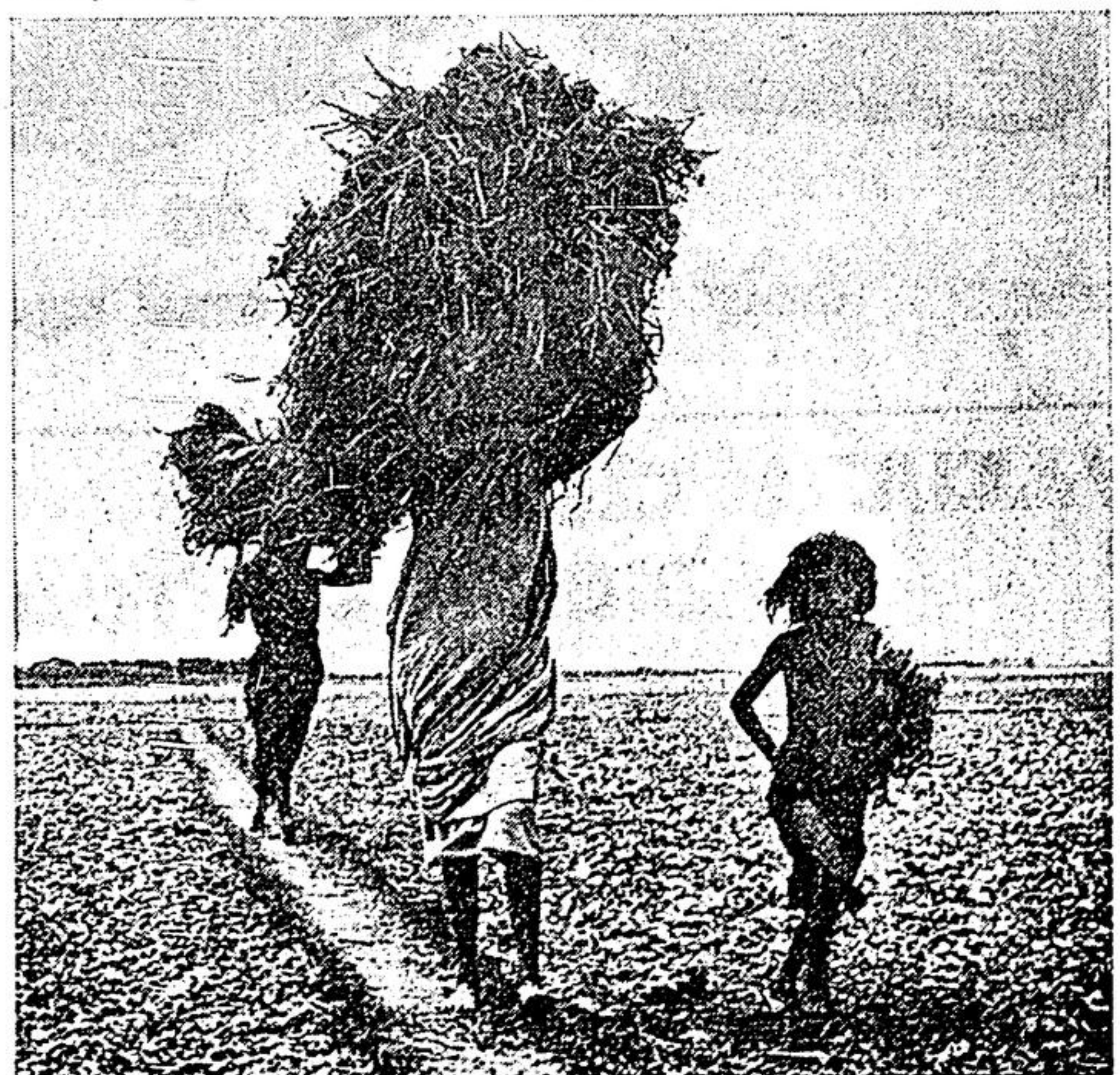
HARVEST HELPERS —This farm wife looks as if she's modeling the latest in weird hairdos, but she's helping carry home harvest in Dacca, East Pakistan.