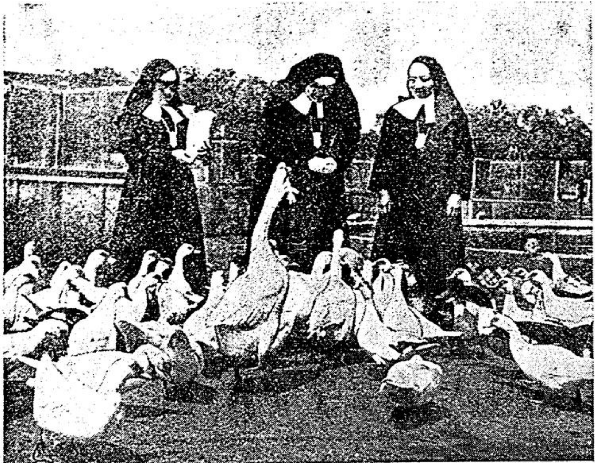
Feeding the ducks is one of the chores on "farm."