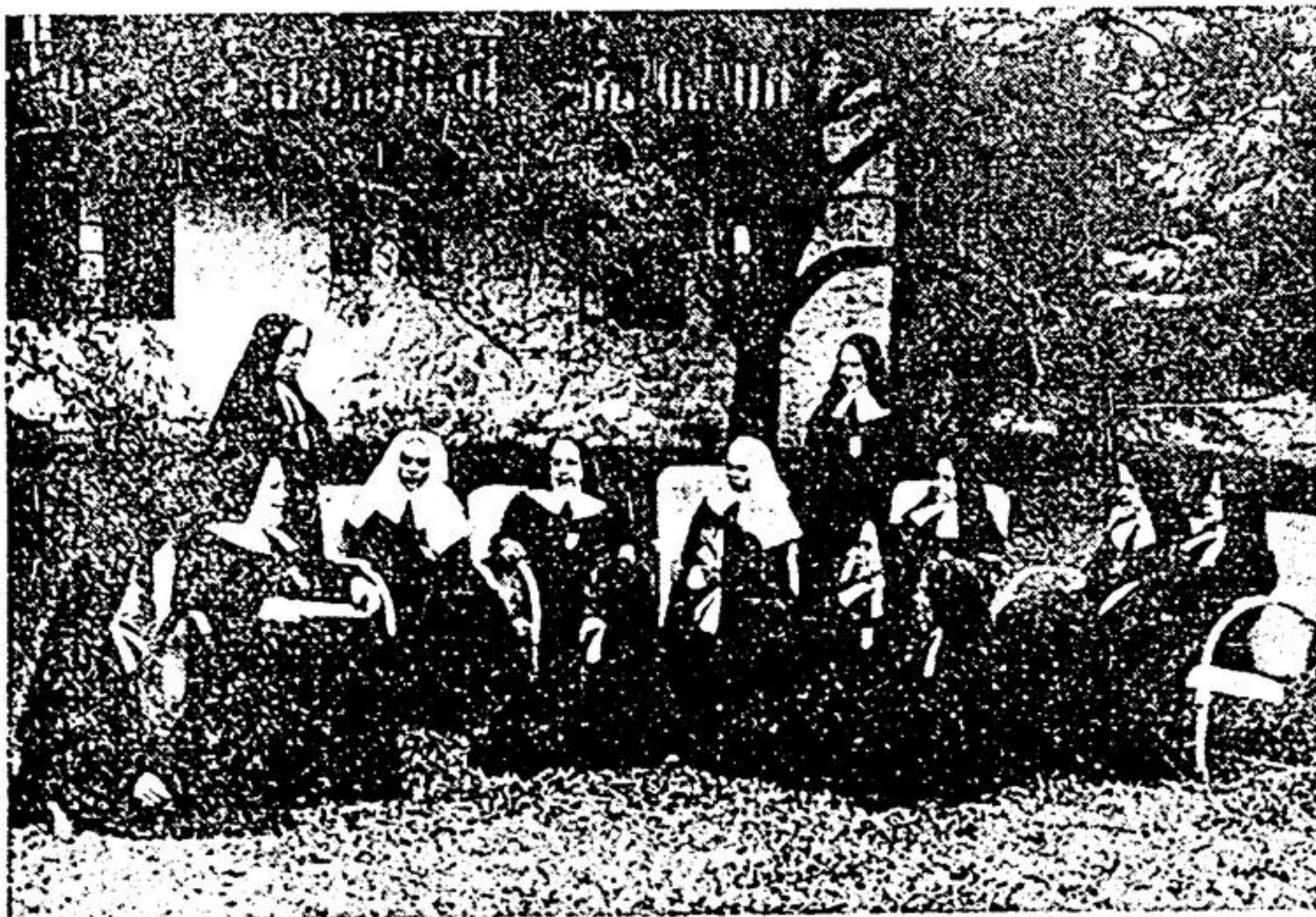
After their farming is done for the day, the sisters gather for their devotions.