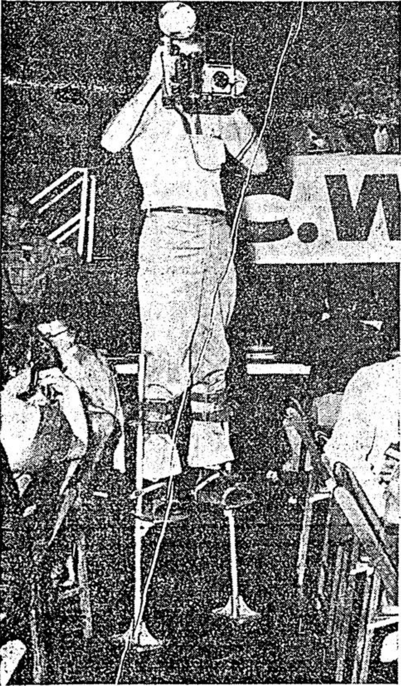
Stilts aid an upbeat angle to convention photo.