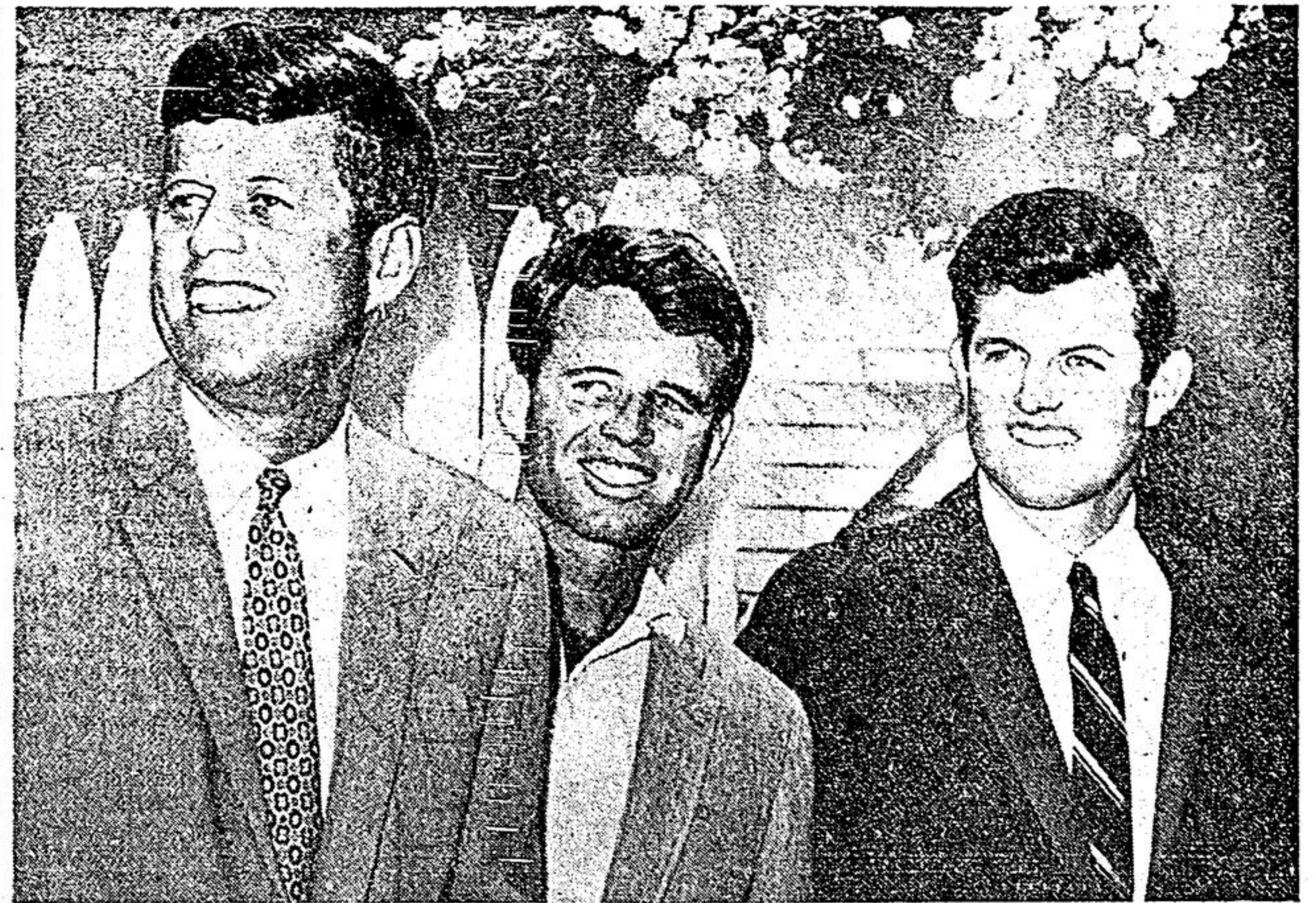
POLITICS IS THEIR PROFESSION—Three Kennedy brothers—Senator John F., Robert F., and Ted—break up a huddle in Hyannis Port, Mass., long enough to pose for cameramen. They are holding one of their conferences at summer home of the Democratic presidential nominee.