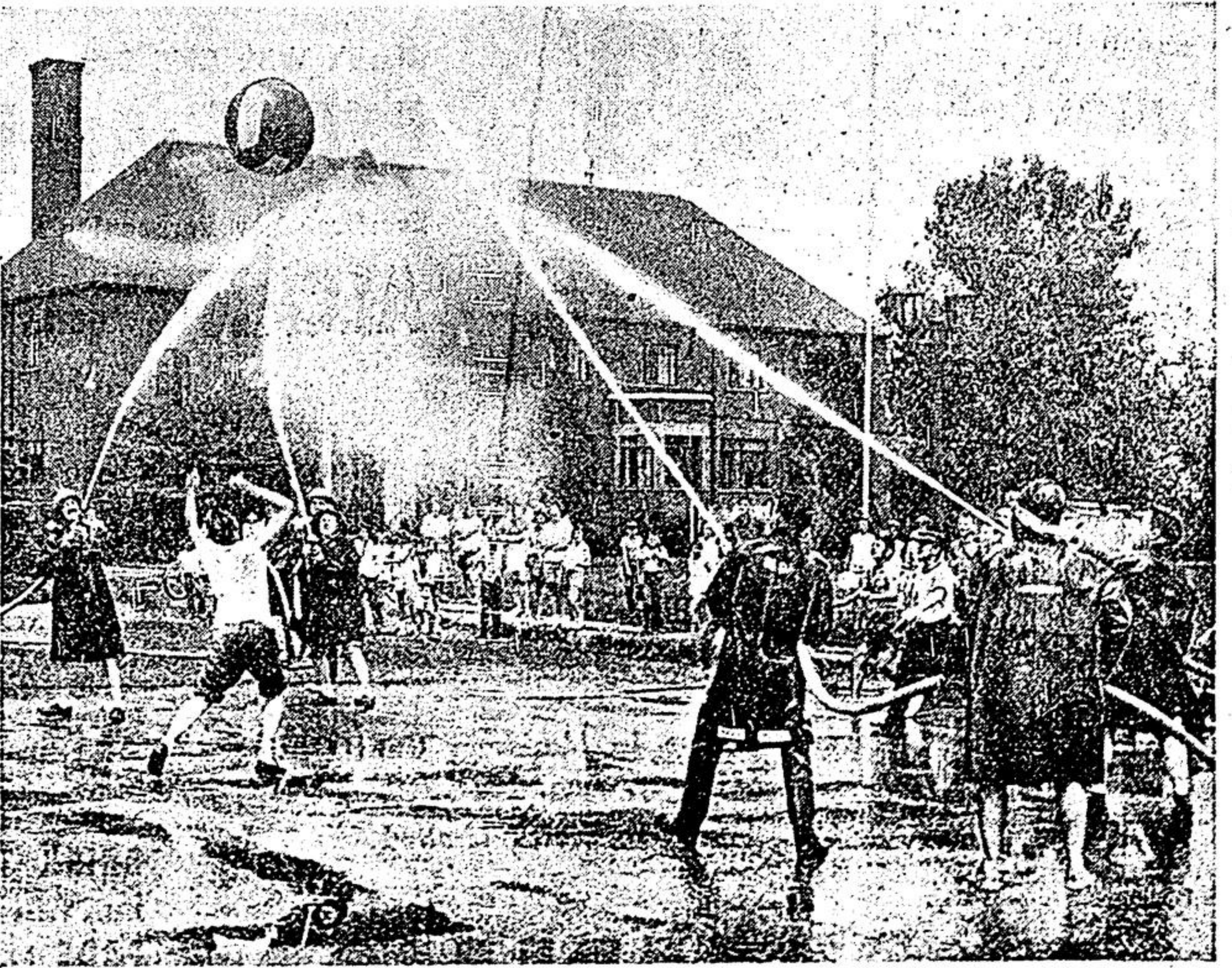
FIREFIGHTERS FIGHT EACH OTHER—Firemen from Middleburg Heights and Strongsville, O., call this a "game," but it looks more like "cold war." Photographer Chet Wozney ran out of range a few seconds later.