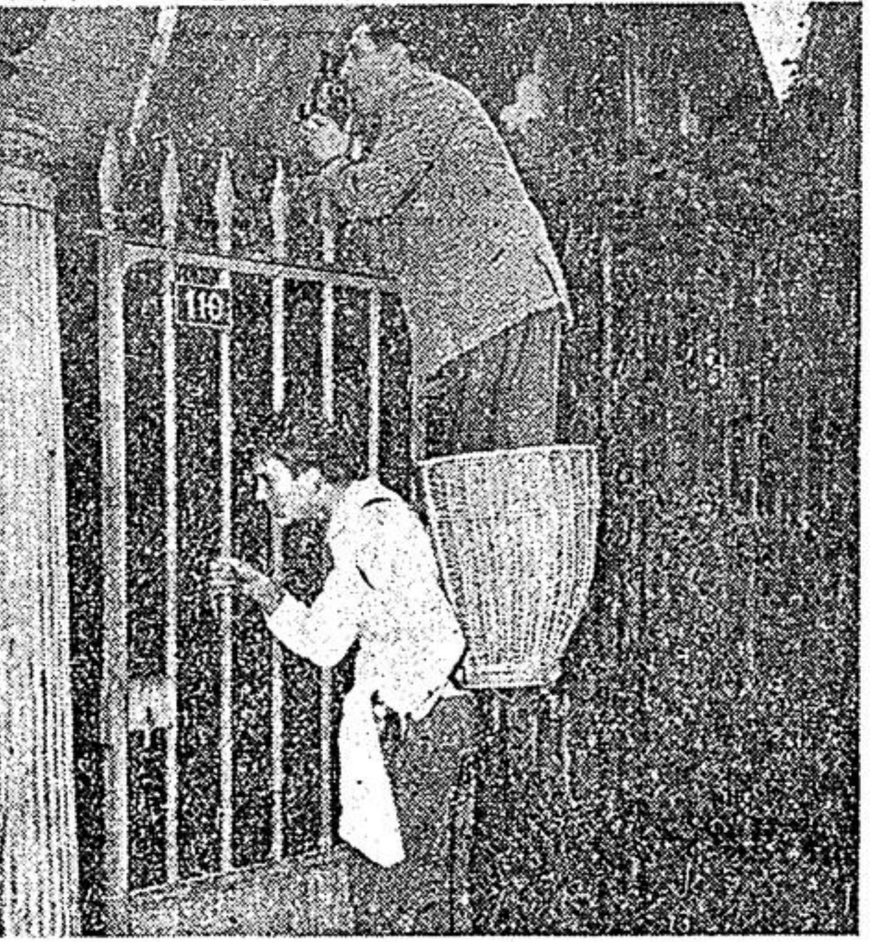
A basket-carrying friend helps him get a difficult shot.