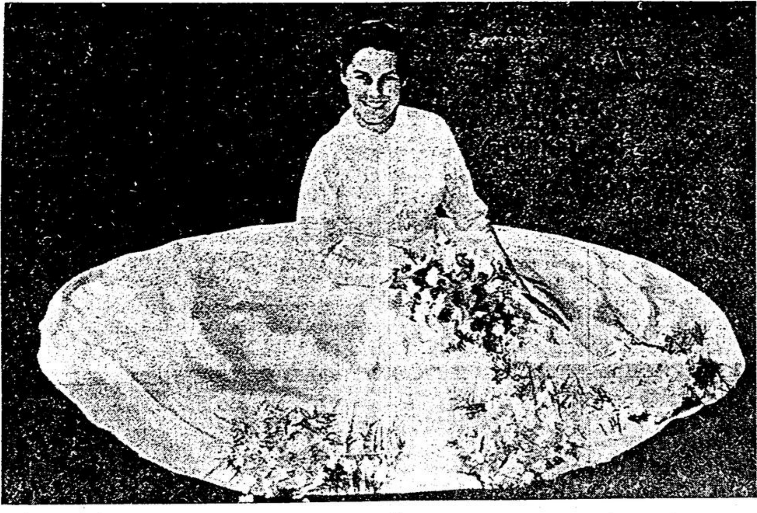
A Pretty Picture