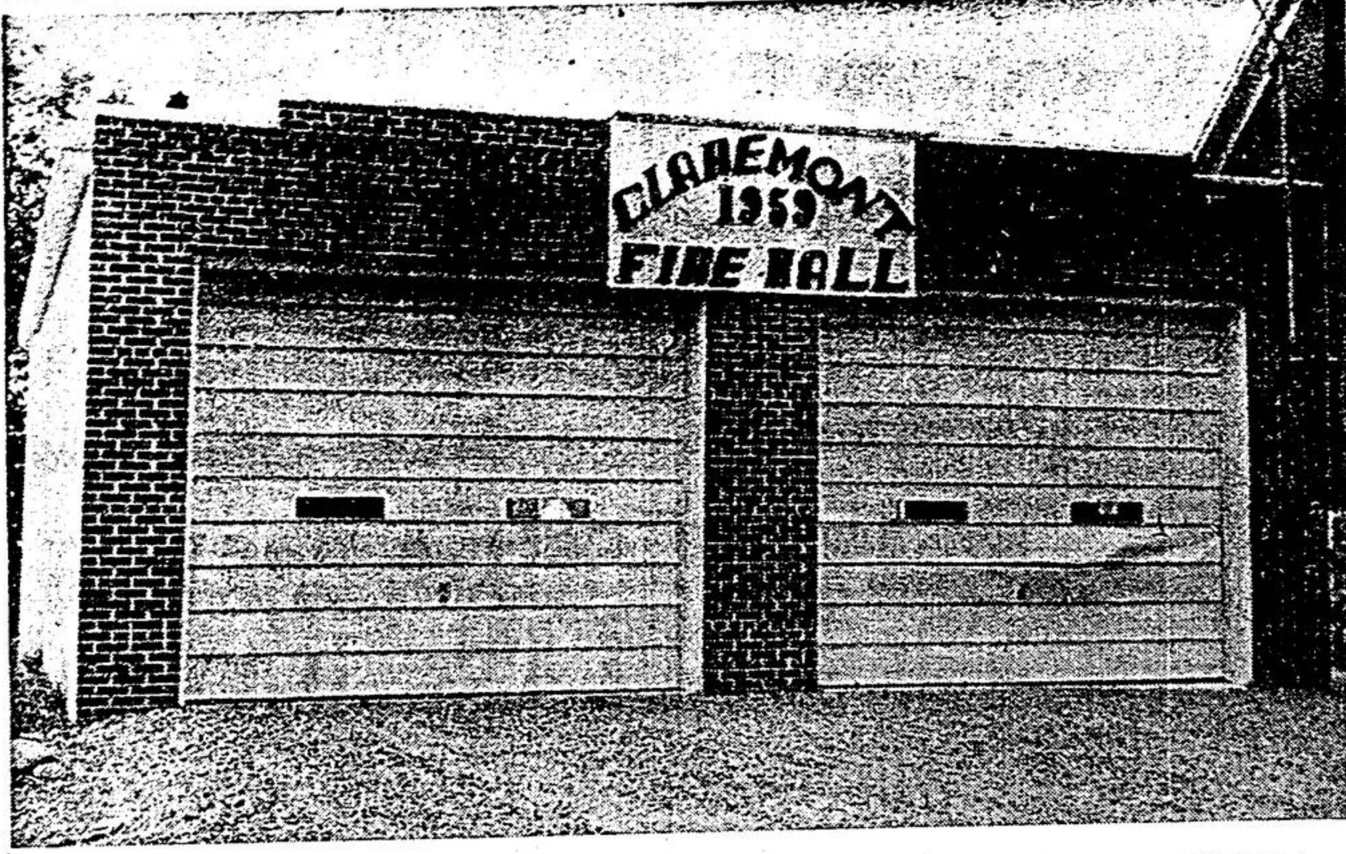
The new Claremont fire hall was erected in the Police Village at a cost of only $6,700.00. It is adequate to accommodate both the fire engine and a truck, newly-purchased water tank.