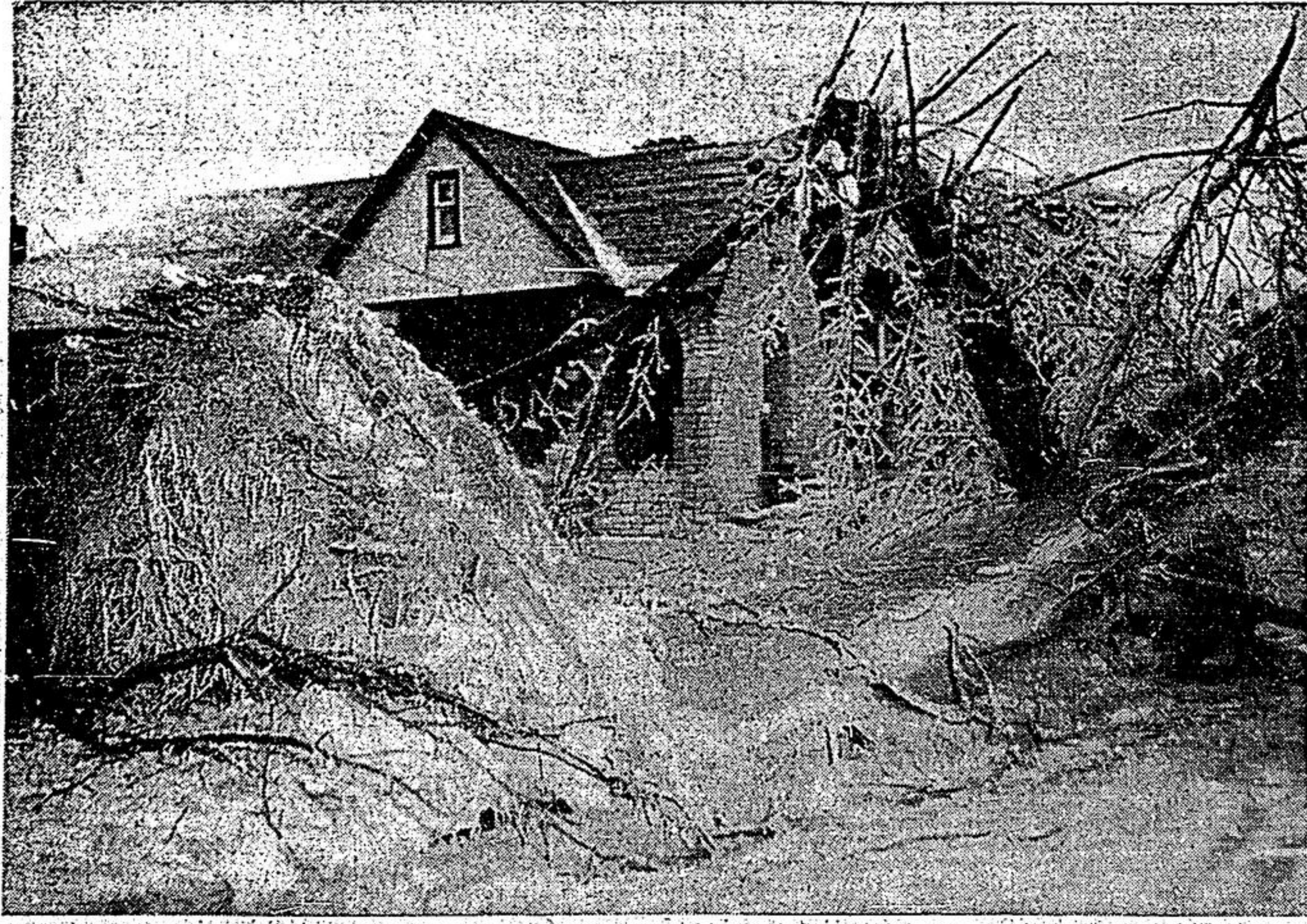
The village of Markham was one of the hardest hit communities in the district. The Main Street was cut off to through traffic early Monday morning when trees and broken branches toppled across the highway. Shown here, one large tree was uprooted and crashed down dangerously close to the Orville Heisey home in Mount Joy. Telephone and hydro wires were twisted and tangled.