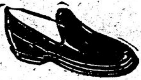
STORM OVER $2.98