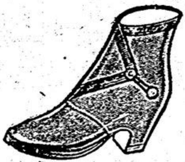
LADIES' & MISSES' PLASTIC SPLASHER $1.98