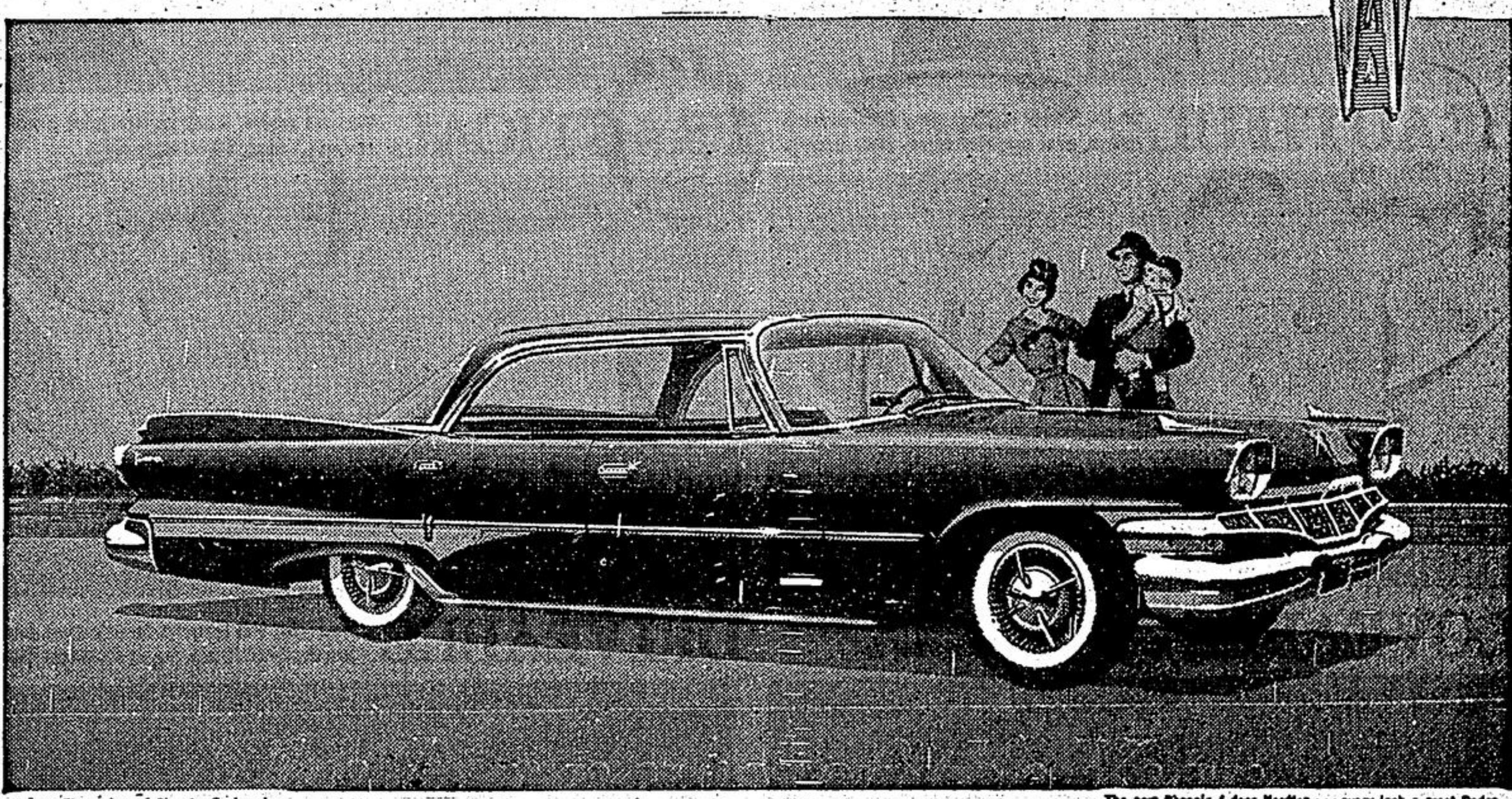
A quality product of Chrysler Engineering. The new Plymouth 4-door Hardtop... every lock a great Dodge.