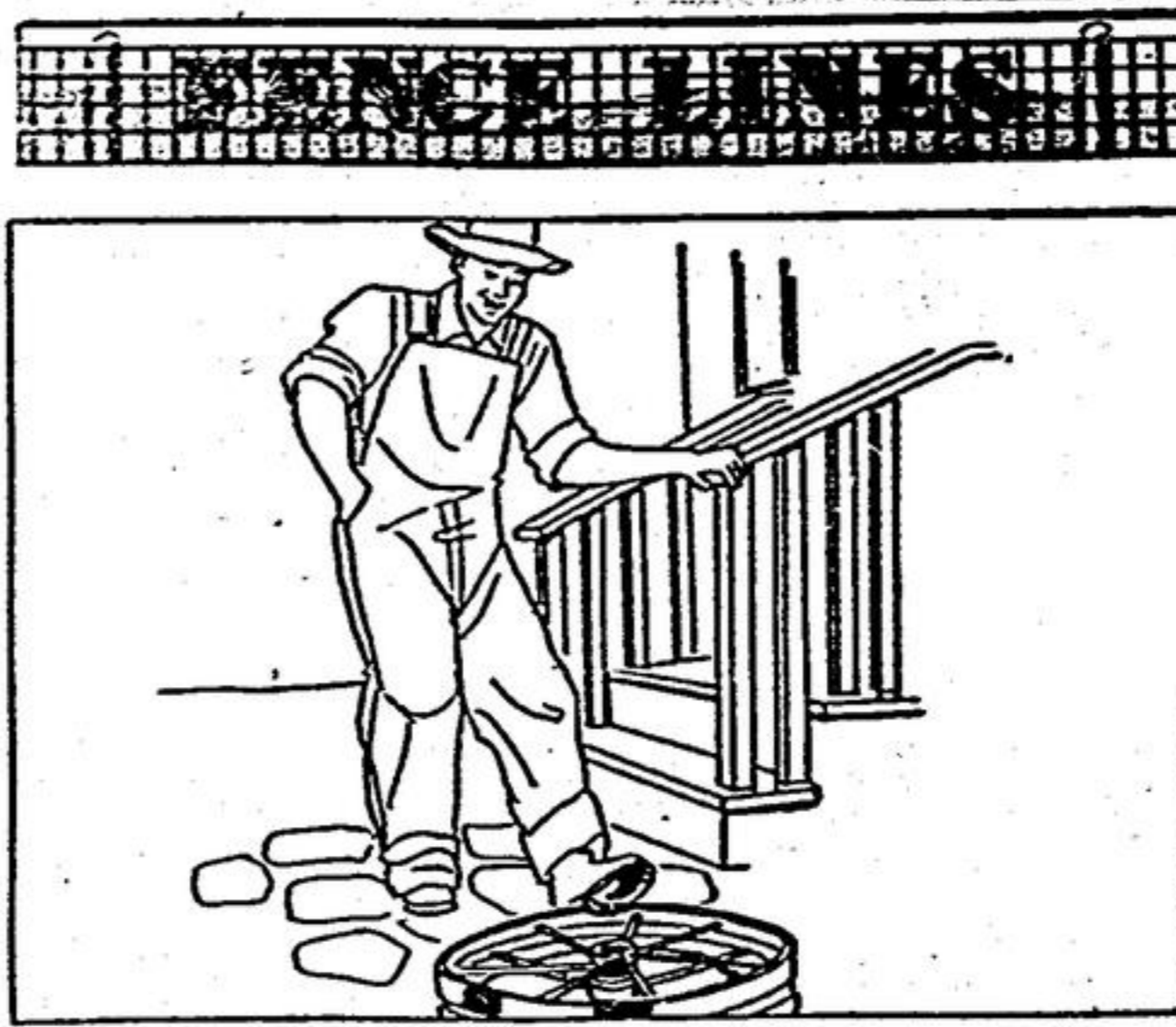
GOOD SCRAPER... Old steel wagon wheel can be put to use that will delight the lady of the house. Paint the wheel and anchor it near the porch steps for use as a foot scraper.