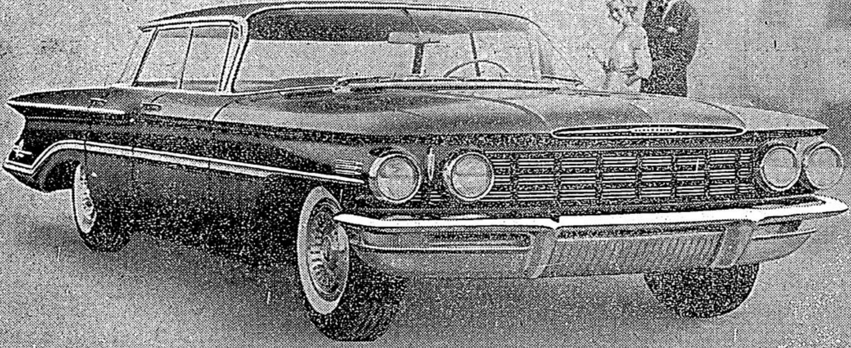
A GENERAL MOTORS VALUE THERE'S NOTHING LIKE A NEW CAR... MAKE YOURS A ROCKET ENGINE OLDS. 1960 SUPER 88 HOLIDAY SPORTSEDAN

HERE TODAY! The Most Satisfying car you've ever known!