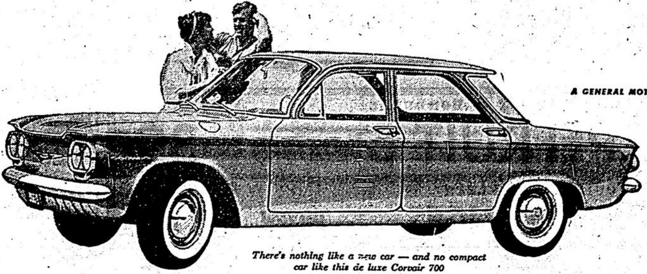
There's nothing like a new car — and no compact car like this de luxe Corvair 700

★★ WITH THE ENGINE IN THE REAR WHERE IT BELONGS IN A COMPACT CAR!