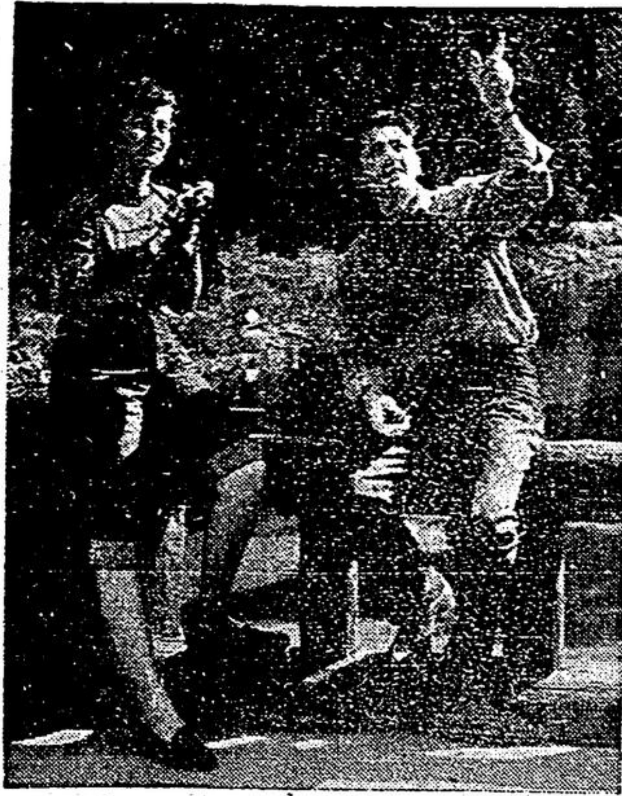
A good example of side-lighting that gives a roundness to the faces and eliminates squinting. Try to use the sunlight in this way in all your vacation snapshots.

sation across the entire Province. Offers to purchase the orphaned animals came from such distant points as North Bay, Sudbury and Sarnia. A number of private parties wished to enlarge the reward money with individual donations.