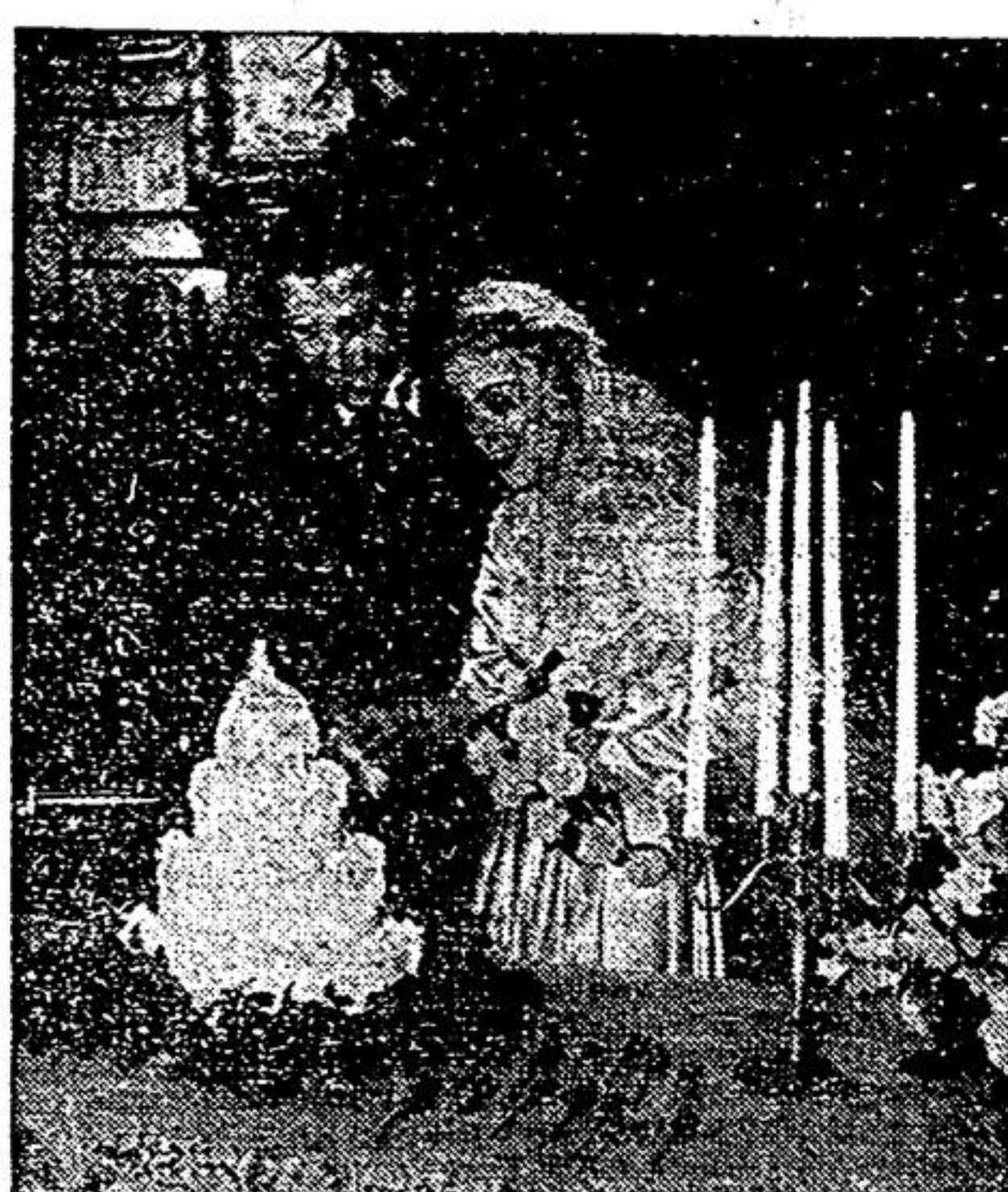
A snapshot of the bride and groom cutting the wedding cake is essential to your picture-story. Arrange it carefully and take two or three shots to make sure you will have a good one.