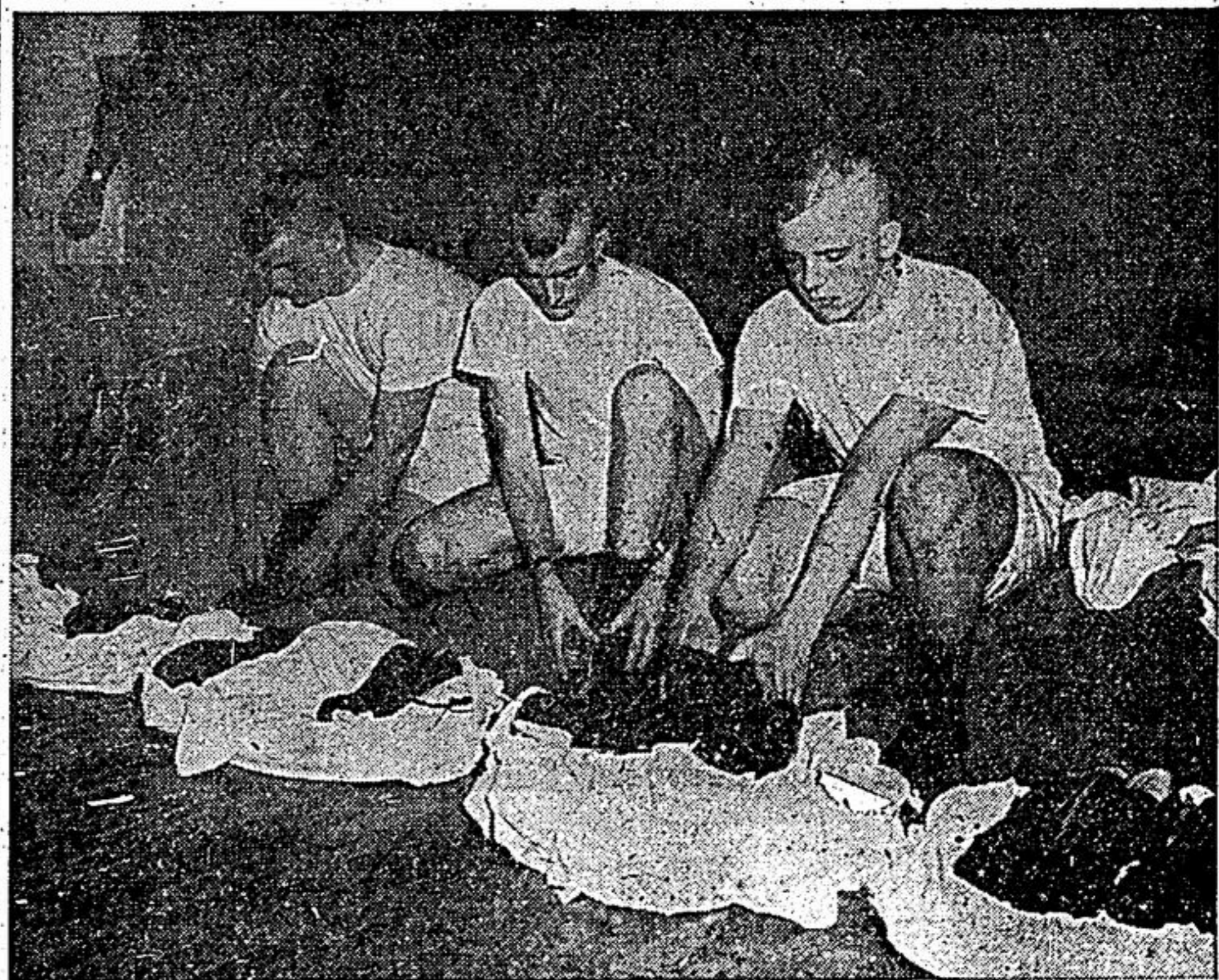
Former Navy men will take a delight in seeing these "boots" getting their gear.