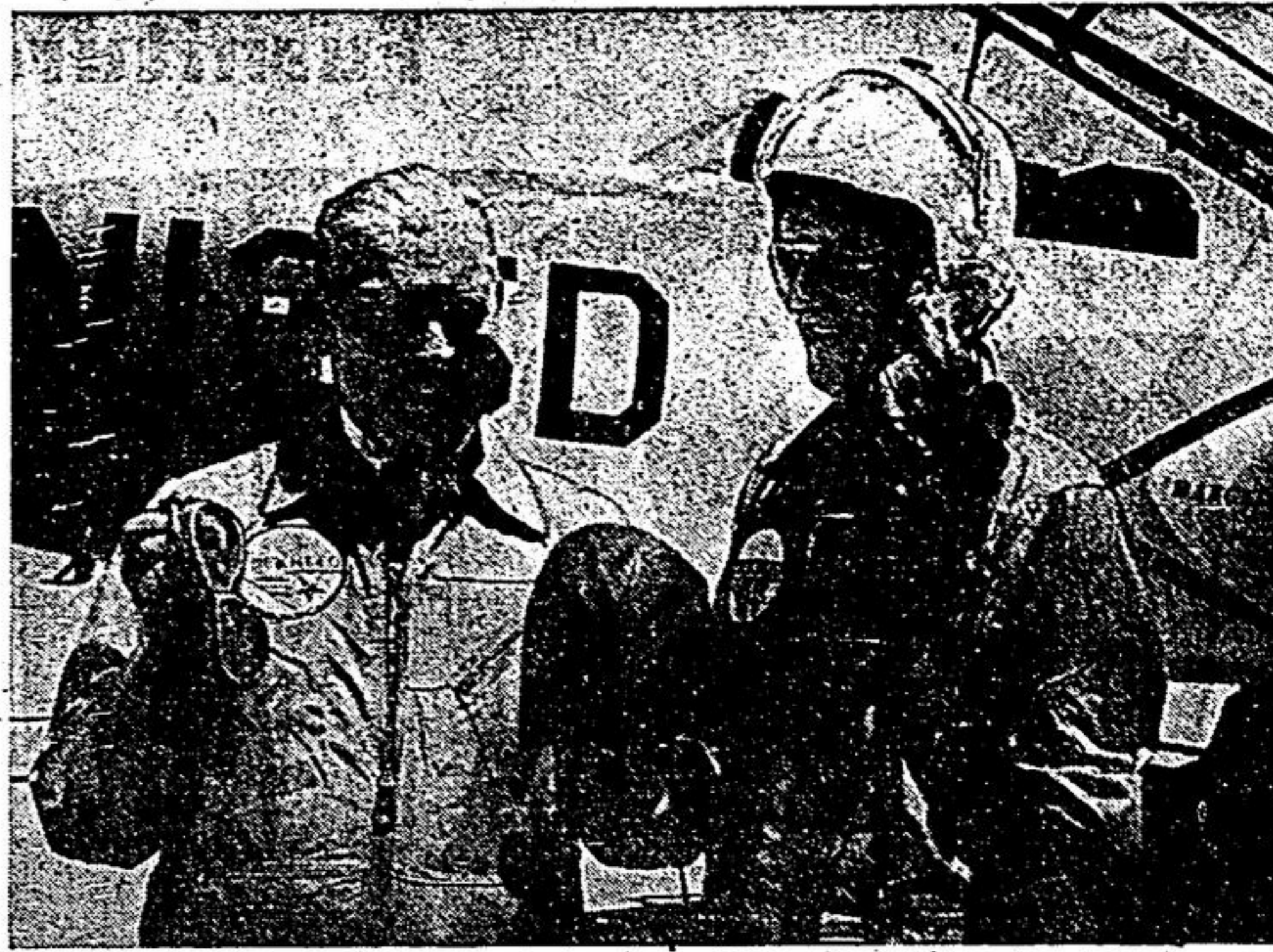
TURNER RETURNS —Col. Roscoe Turner (left), one of America's best known aviators and three-time winner of the Thompson trophy, compares "then-and-now" pilot equipment after his first jet ride with A. W. (Tony) LeVier, former racing rival. LeVier and Turner are renewing acquaintance in Burbank, Calif.