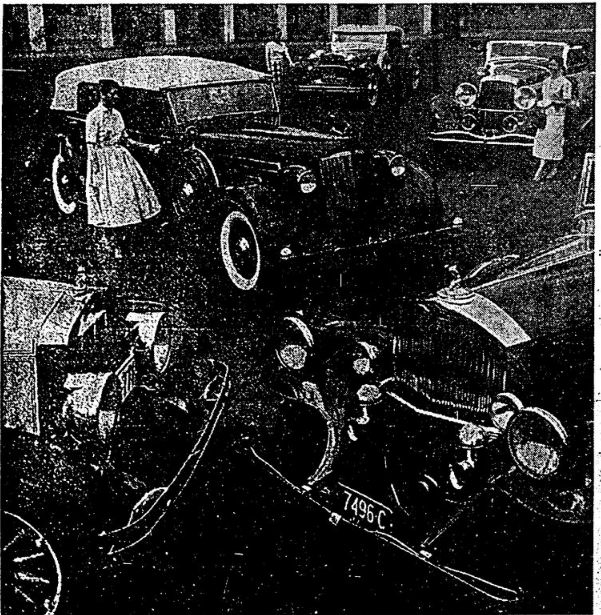
OLD CAR MEMORIES —These cars from 1925-36 era will be displayed at Greenfield village, in Dearborn, Mich., during an exhibit of ancient cars. Starting at lower left and going clockwise are a 1925 Franklin Roadster; a 1936 Packard; a 1935 Duesenberg and (right foreground) a 1932 Pierce Arrow roadster.