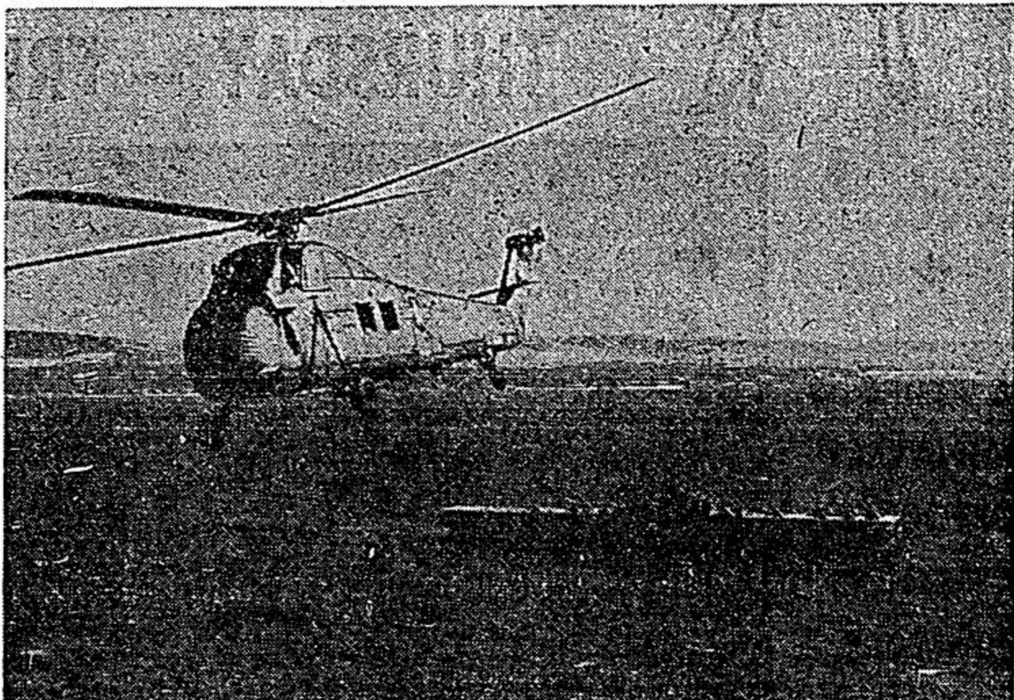
TARGET: PANAMA CANAL —A helicopter from Marine Air group 26 takes off from the carrier Leyte during a training flight preparatory to a mock attack on the Panama canal. The Leyte is proceeding from Vieques island, Puerto Rico.