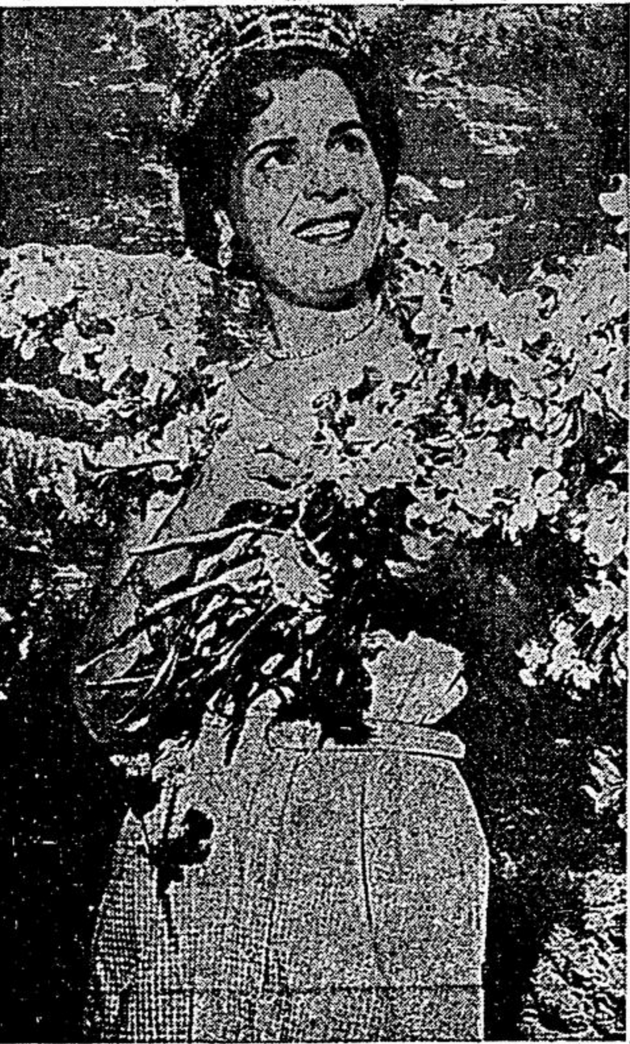
A RARE BLOOM —Actress Lily Lodge is the new queen of the apple blossom festival of New Jersey. Event introduced a drink called "Apple Blossom." It's a combination of applejack and fresh orange juice.

F ORTY miles north of Chicago, the world's largest naval training station is holding a "summer-long homecoming" for two million "old grads." This is to mark the fiftieth anniversary of Great Lakes as a center for turning out Navy men and women. There are some ten to 20 thousand recruits on the premises now. This homecoming is being handled on a state-by-state basis. A review will be featured each Saturday morning, one that the "old grads" will recall with nostalgia. They will find that Great Lakes is a city of 30 thousand, including the permanent personnel. There are 19 schools in operation. A campus building program is changing the old brick and glass plant, topped by a 12-story hospital. The training center, itself, sprawls over more than 1,500 acres.