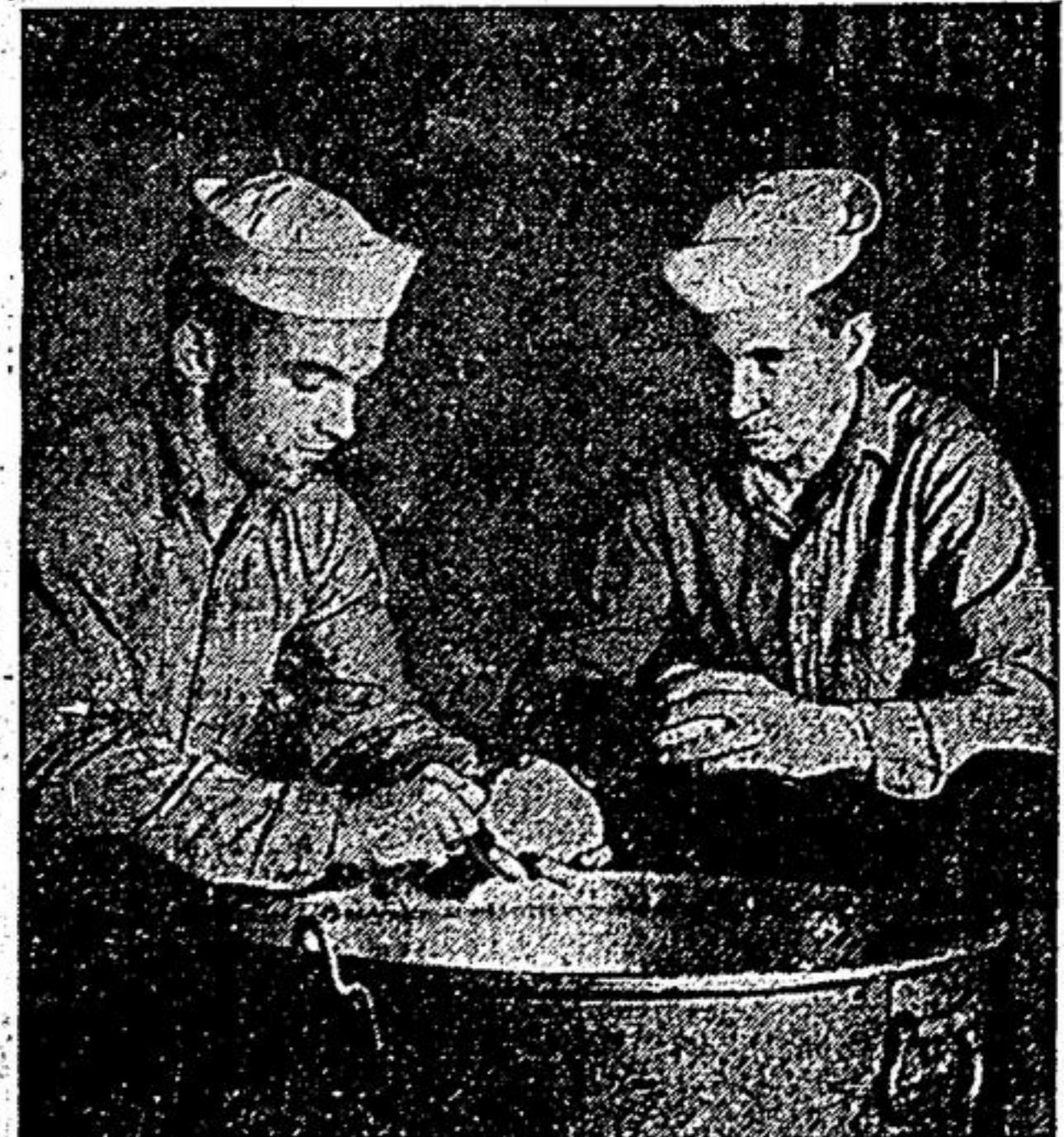
They'll grin at recruits peeling potatoes for mess.

F ORTY miles north of Chicago, the world's largest naval training station is holding a "summer-long homecoming" for two million "old grads." This is to mark the fiftieth anniversary of Great Lakes as a center for turning out Navy men and women. There are some ten to 20 thousand recruits on the premises now. This homecoming is being handled on a state-by-state basis. A review will be featured each Saturday morning, one that the "old grads" will recall with nostalgia. They will find that Great Lakes is a city of 30 thousand, including the permanent personnel. There are 19 schools in operation. A campus building program is changing the old brick and glass plant, topped by a 12-story hospital. The training center, itself, sprawls over more than 1,500 acres.