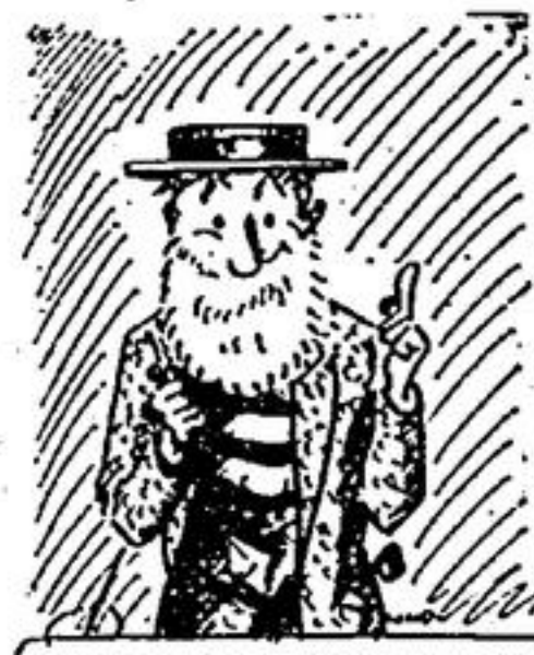
SOME MEN BECOME IMMORTAL MAKING USE OF OUR MOMENTS MOST PEOPLE THROW AWAY.