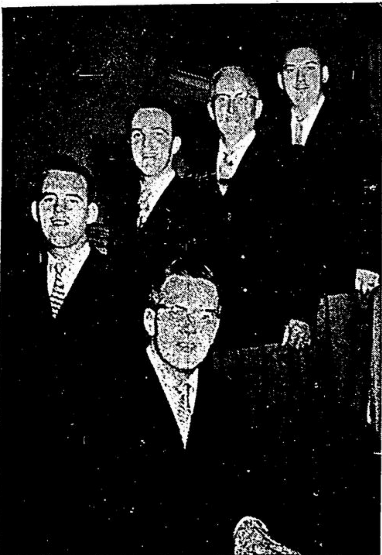
Calvary Gospel Quartette of Toronto

Weeknite Services, except Saturday, 8 p.m. Sunday Broadcast, 8.45, C.K.L.B. Services at the Tent 2.00 and 7.30 p.m.