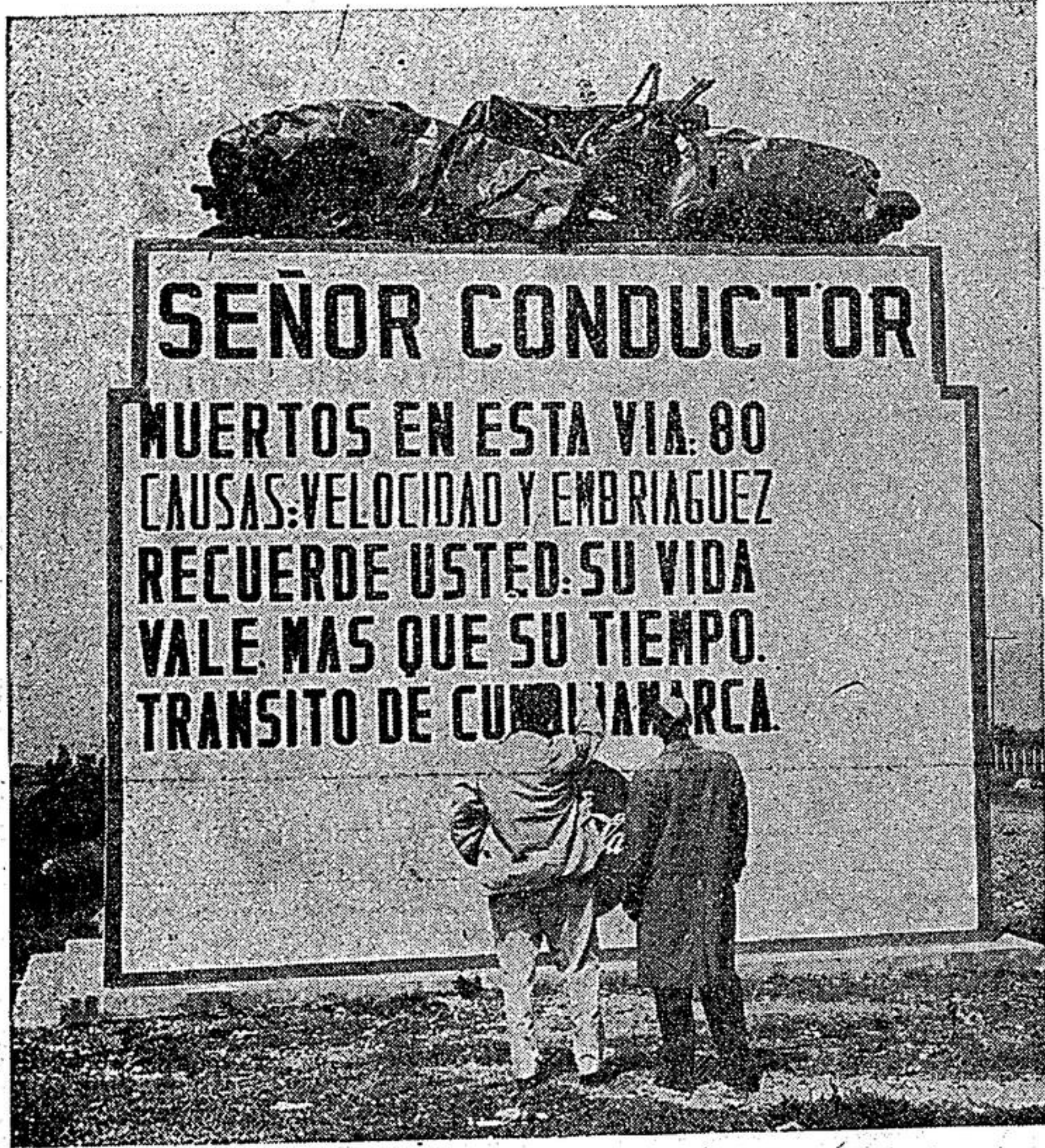
WRECK-LESS, NOT RECKLESS —While Colombia is spending millions for new highways, she is trying to persuade speeders to curb their dangerous driving. This sign between Bogota and Girardot tells its own story—that fast driving and "one for the road" mean crackups. Accidents have killed 80 persons so far.