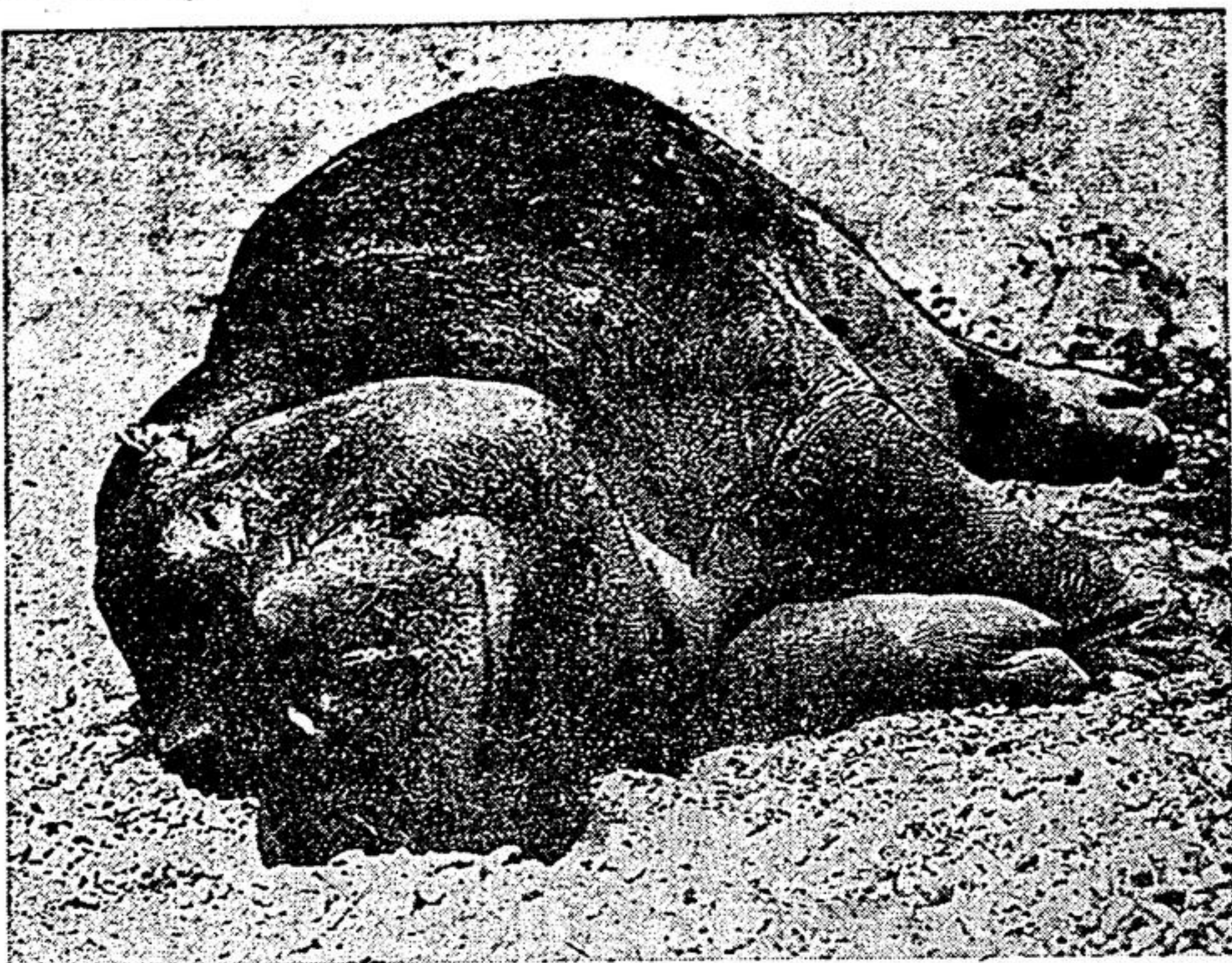
'SOMME' IN THE SUN —Catching forty winks ("somme") at Vincennes zoo in Paris, this hippo ignores pesky visitors seeking to take his photo for their albums.