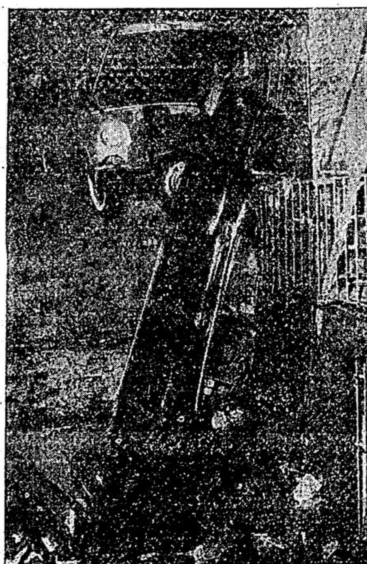
ALARMING SIGHT—A fireman surveys the damage caused when a runaway auto, tottering on the brink, rammed another car through a garage and sent it down into areaway, in Brooklyn. No one was injured.