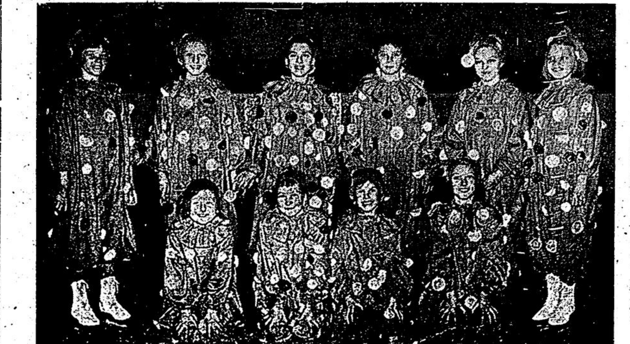
Young girls in "Crazy Clowns" are part of annual Ice Revue at the Stouffville Skating Club's Arena on Friday evening, March 15.