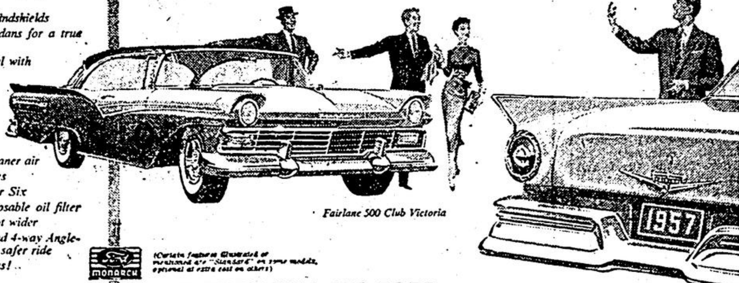
Fairlane 500 Club Victoria

This is the 25th anniversary of Ford's V-8 leadership... and the new kind of Ford for '57 brings you even more of the kind of performance that made Ford the leader! Now Ford offers three brand-new V-8's—the 190-Hp. Ford V-8, the 212-Hp. Thunderbird V-8 and the mighty new 245-Hp. Thunderbird Special V-8! And Canada's newest SIX—the '57 Mileage Maker—is available in all Custom and Custom 300 models and in three popular station wagons!