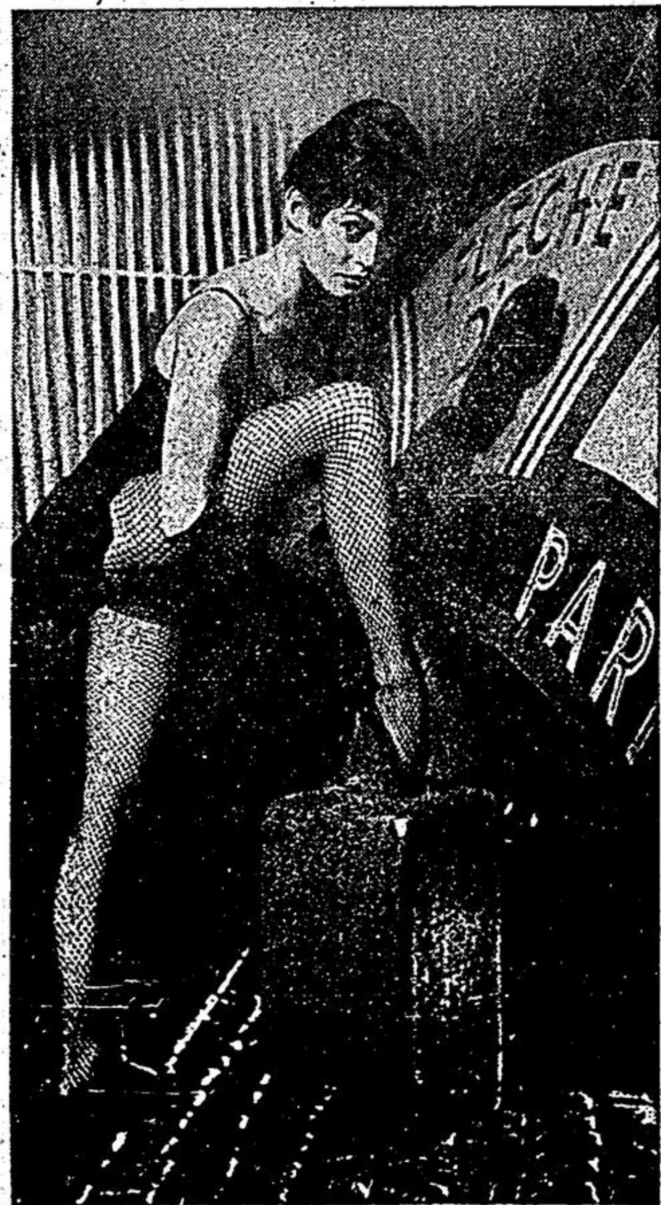
A STEP UPWARD—French starlet Brigitte Bardot goes through her ballet lessons in London film studio where she was recently given her first starring role in a British farce, "Doctor At Sea." She's a singer and actress also.

Another reason fishing is such a great pastime is that it causes a person to have temporary partial amnesia — it makes him forget he has to work for a living. Folks are just itching to get away on vacation and will come back just itching.