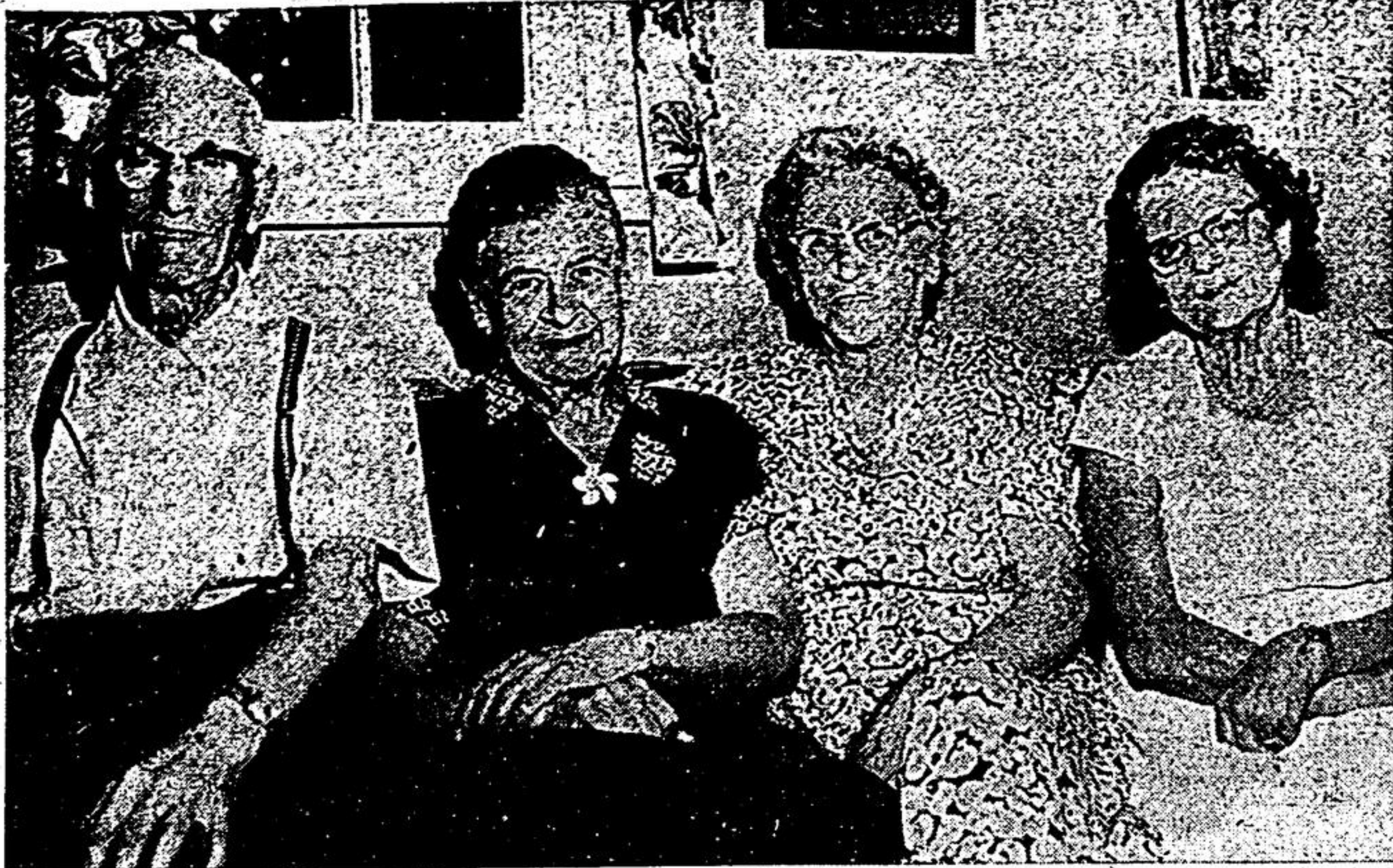
Four of the oldest residents on the South Shore of Musselman's Lake are pictured above. They are, from left to right—