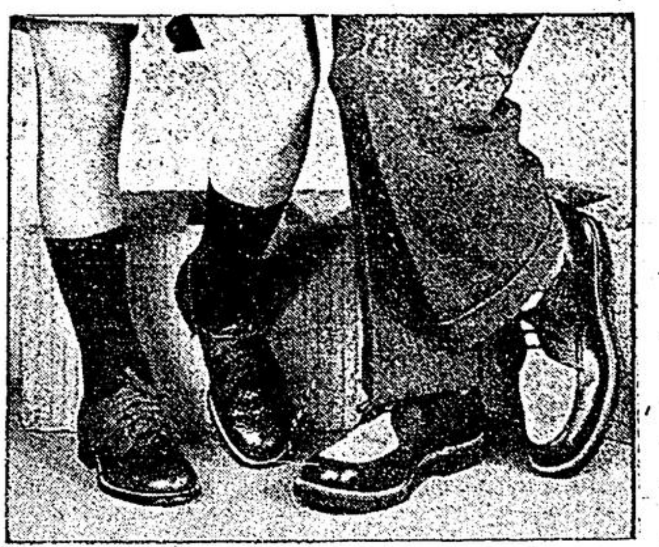
Left, for the spry young lad, a four-eyelet tie oxford with perforated vamp, giving a woven leather effect, for good ventilation in warm weather. Right, for the boy growing up here's a three-eyelet tie casual in tan brown with insert of white at vamp.

The sleek trim lines have been achieved by the use of new tapered lasts in both dress and casual shoes.