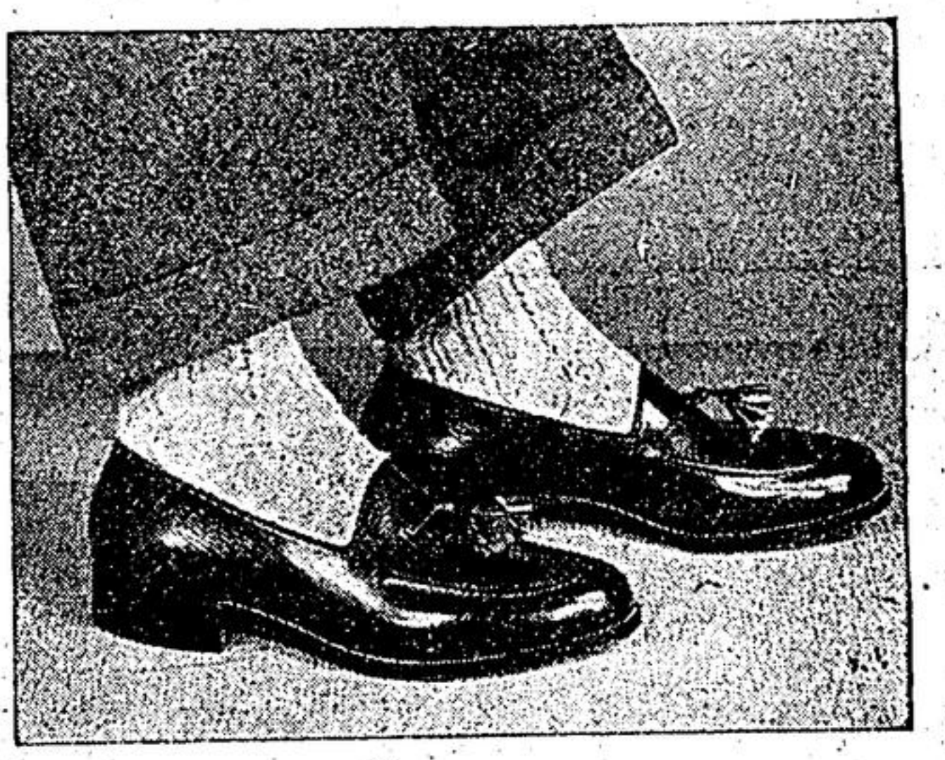
Sleek and slim are these low-top moccasins in crushed leather. An all-time favourite, this shoe has taken on a new look with a Continental air in this very slimmed-down version.

The two-eyelet oxford is among the top choices this coming season. It will be worn in grained leathers, perforated leathers and two-tone combinations. Following closely behind this Spring is the moccasin in the new two eyelet version. The slip-on shoe without gores, sleek and slim looking, will also be a popular choice for boys.