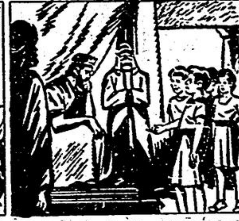
Brought before the king at the end of the period, the Jewish lads were found to have knowledge and skill in all learning. Daniel had understanding of all visions and dreams. All were found better than the magicians and astrologers of the realm.