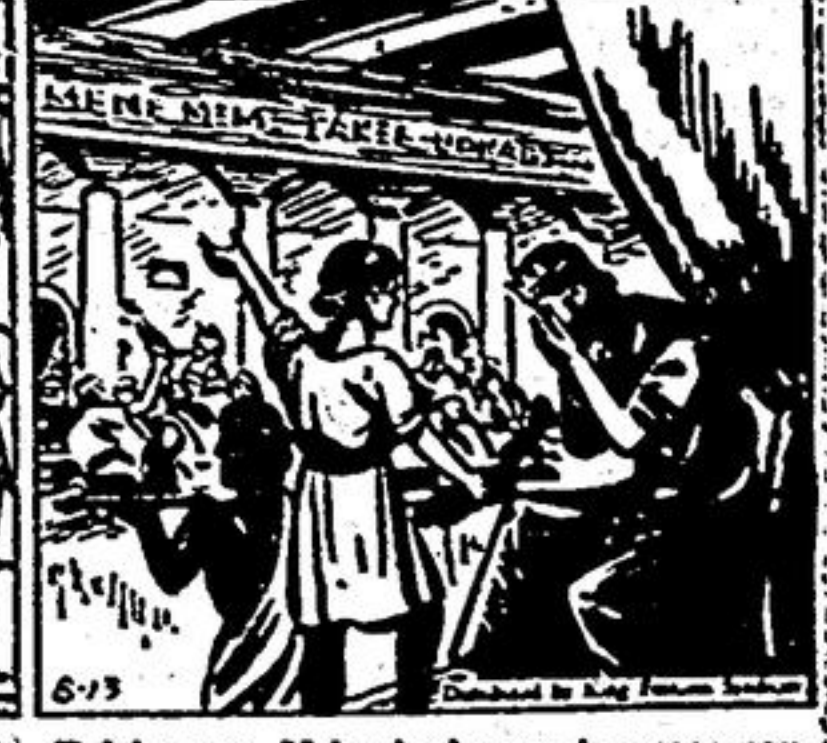
Belshazzar, Nebuchadnezzar's successor, gave a great feast and members of his court drank wine from the gold and silver vessels taken from the Jewish temple. A hand wrote on the wall, and Daniel interpreted the words.