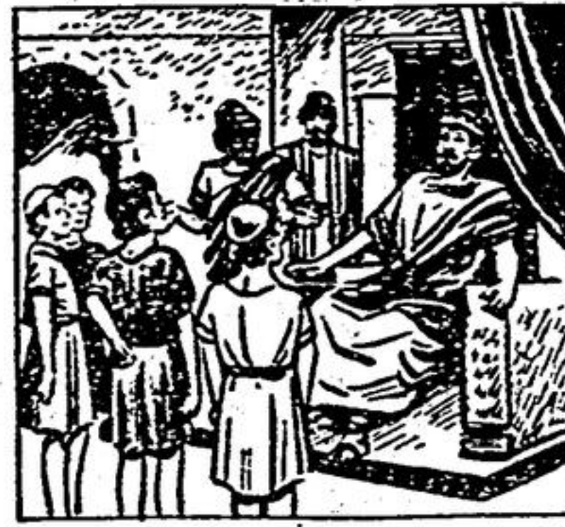
King Nebuchadnezzar told his master of the eunuchs to bring certain healthy, intelligent boys of the captured Jews to him. He brought Daniel and three others. They were to be given food and wine from the king's table to keep them in health.