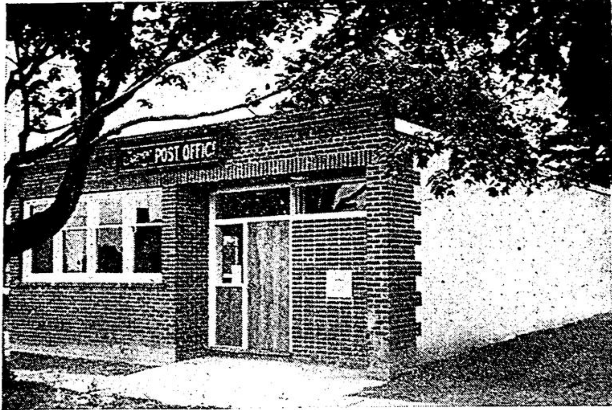
Claremont's new modern Post Office opened its doors to the public for the first time on Saturday. The building, erected by the Ken Betz Construction Co. of Stauffville, is located west of the 9th concession. The structure has modern lighting and heating facilities. The building cost an estimated $15,000.