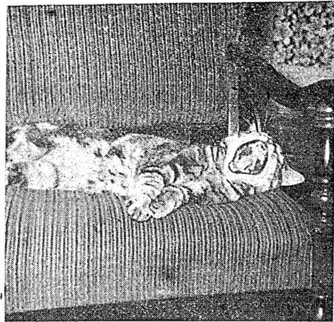
Second prize of $5 went to Pussy enjoying a full yawn on the chair.