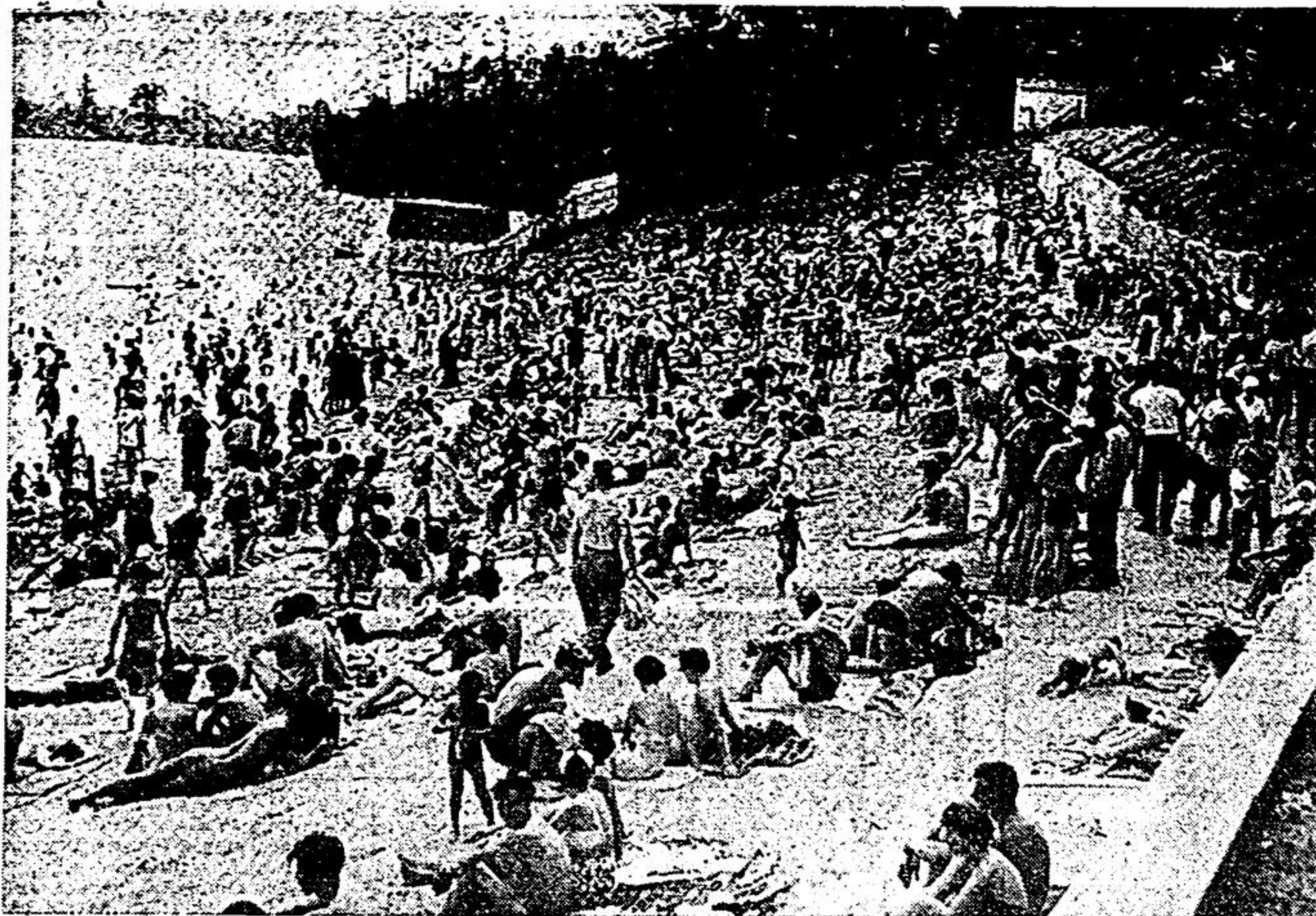
This is a typical scene on the beaches at Musselman's Lake during the summer

months. On weekends, thousands throng the popular resort centre in an effort to