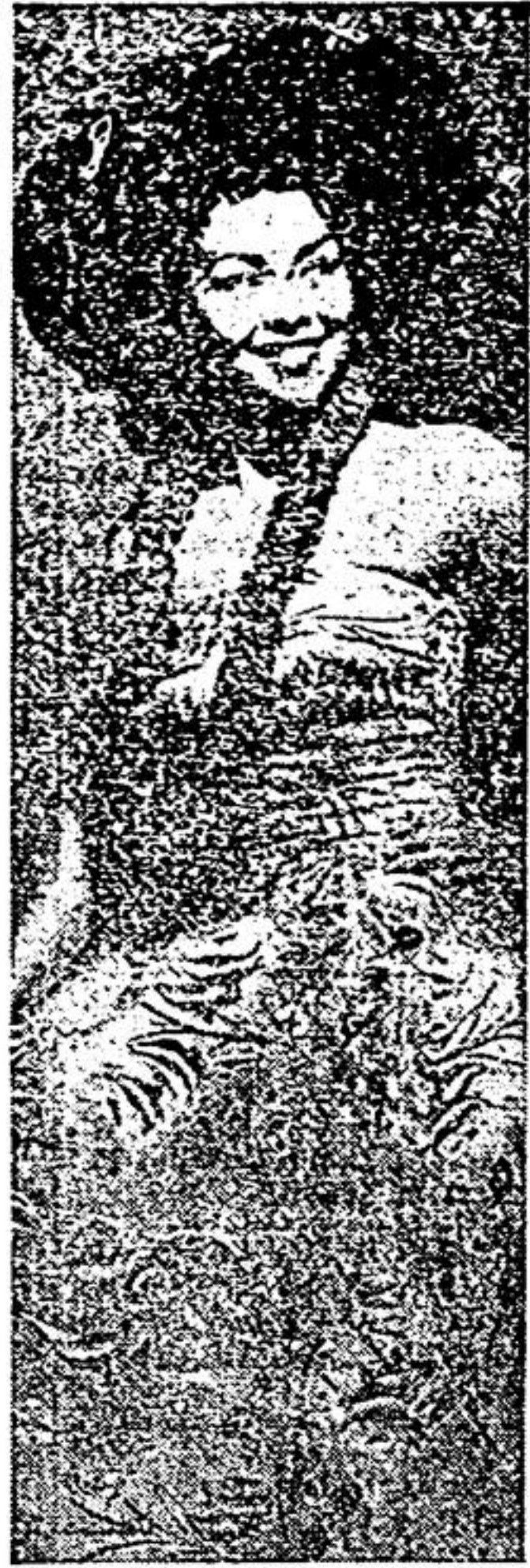
HONO-LULU — This Easter, many Hawaiian cuties wish they could wear these authentic Easter Island headpieces on Waikiki beach. Sundresses and leis are worn Easter and year 'round there.