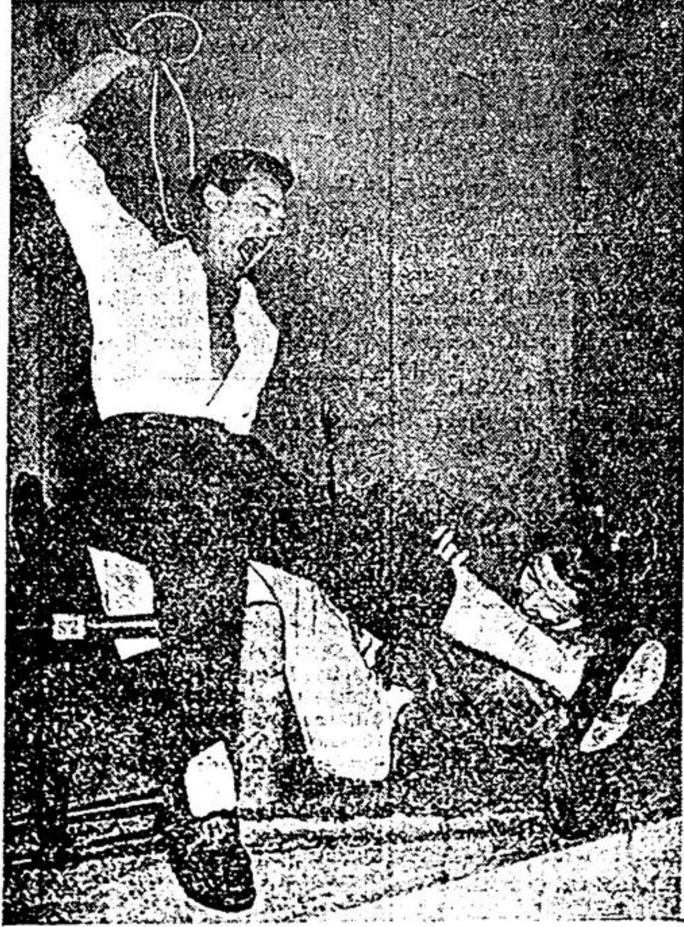
Just who is supposed to be doing the taming in this "bit"?