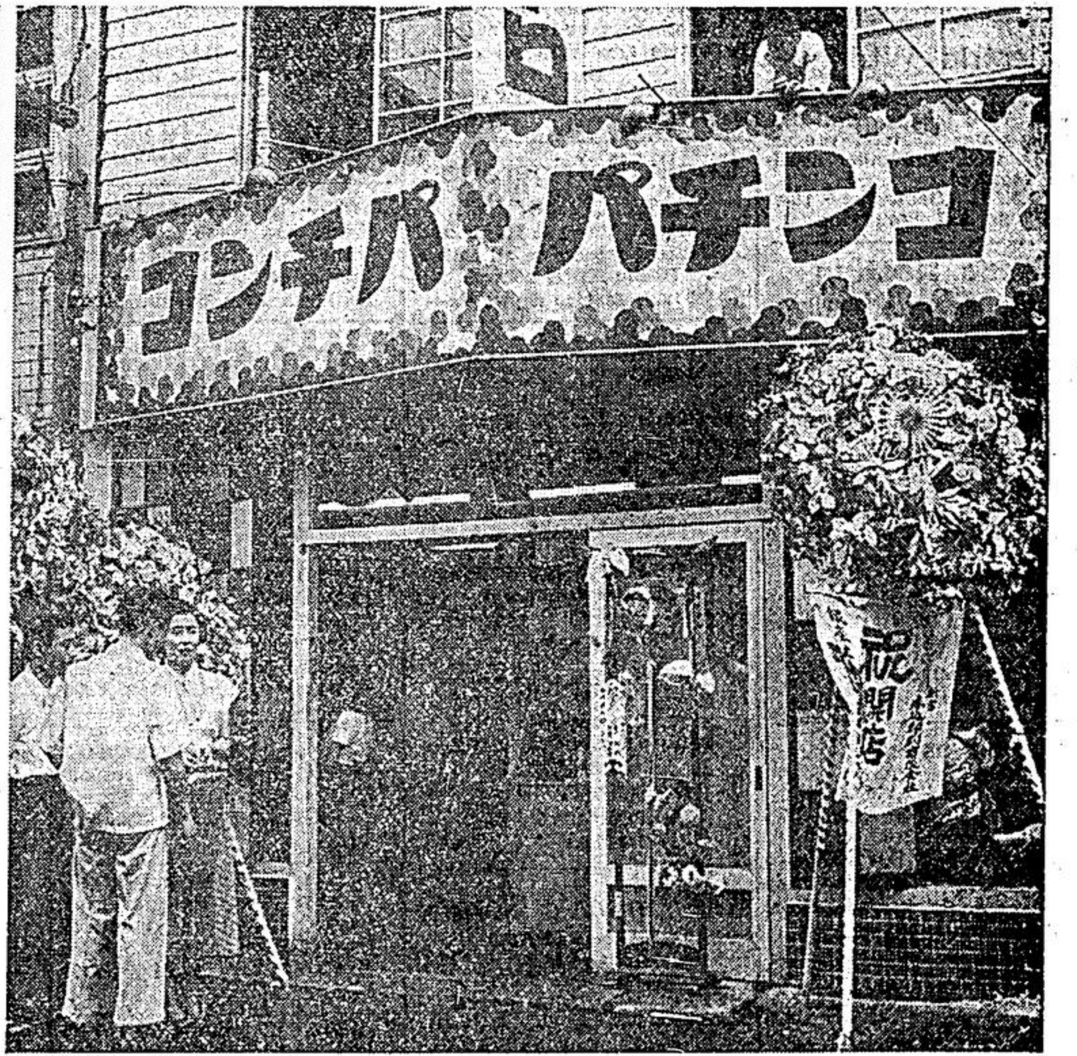
THEY'RE GAME — The grand opening occasion here is to celebrate the addition of another pachinko parlor in Tokyo. It's a pin-ball game that's popular.