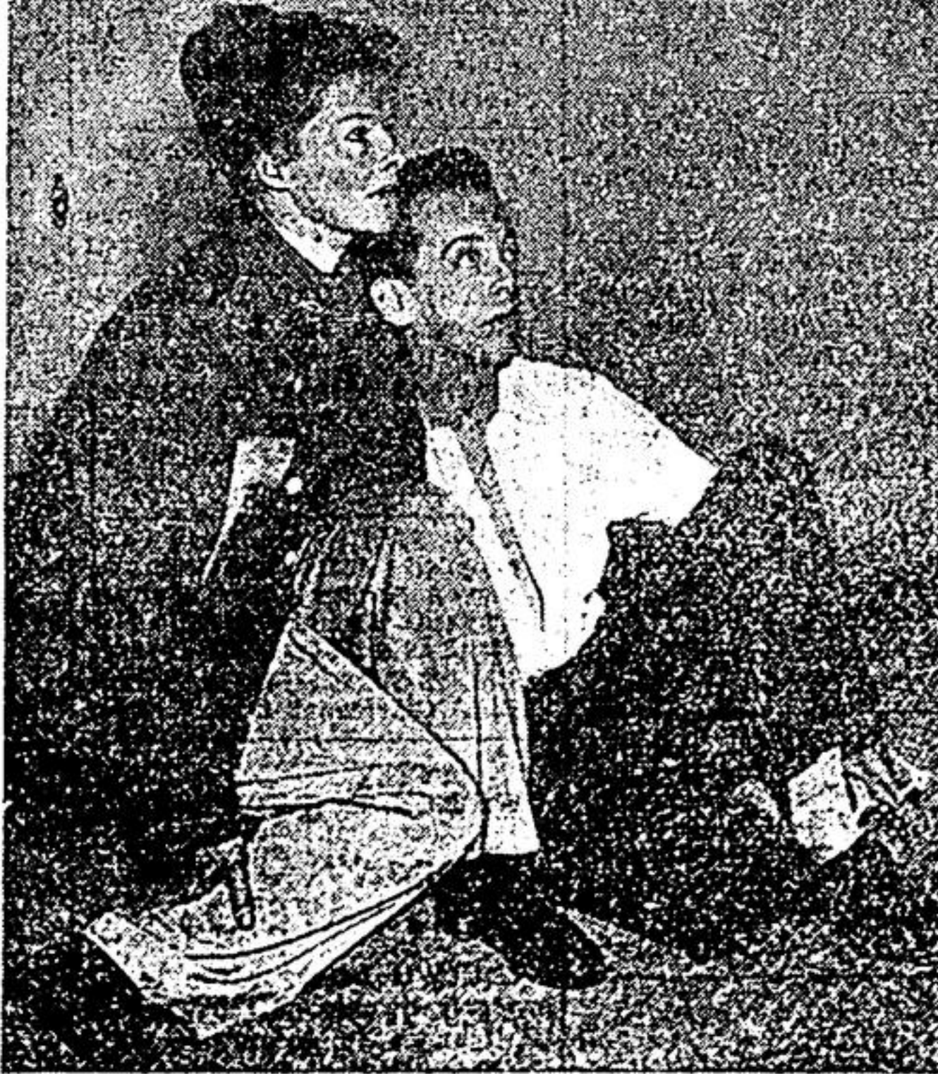
They're both looking forward to a tour of Australia later.