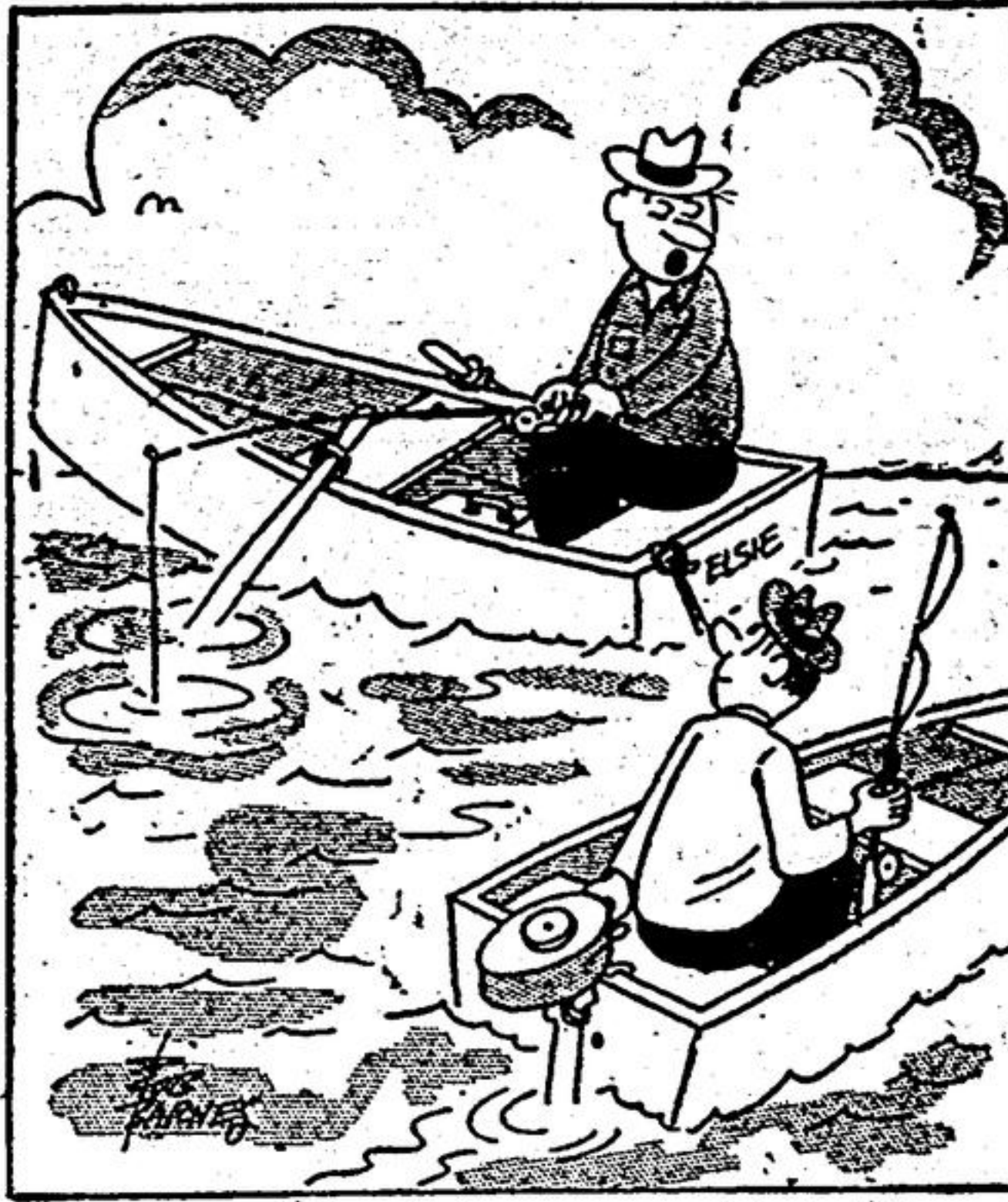
"I'm still getting good results from my Dewey button—What bait are you using?"

personal security of the Directors. At a meeting held March 2nd, 1917, it was resolved that "each member of this Board shall endeavor to secure money in their respective districts, and report each day to the General Manager. Truly, we must have been hard pressed.