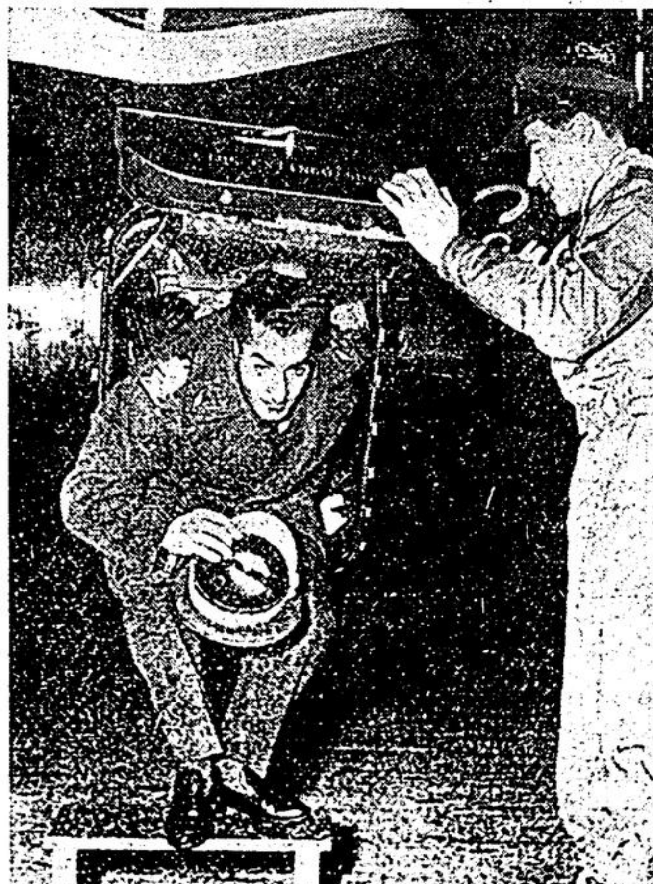
EXIT CROUCHING —The shah of Iran steps out of the fire exit of a Canberra bomber which he had inspected on a brief visit to Royal Air Force station in Kent, England.