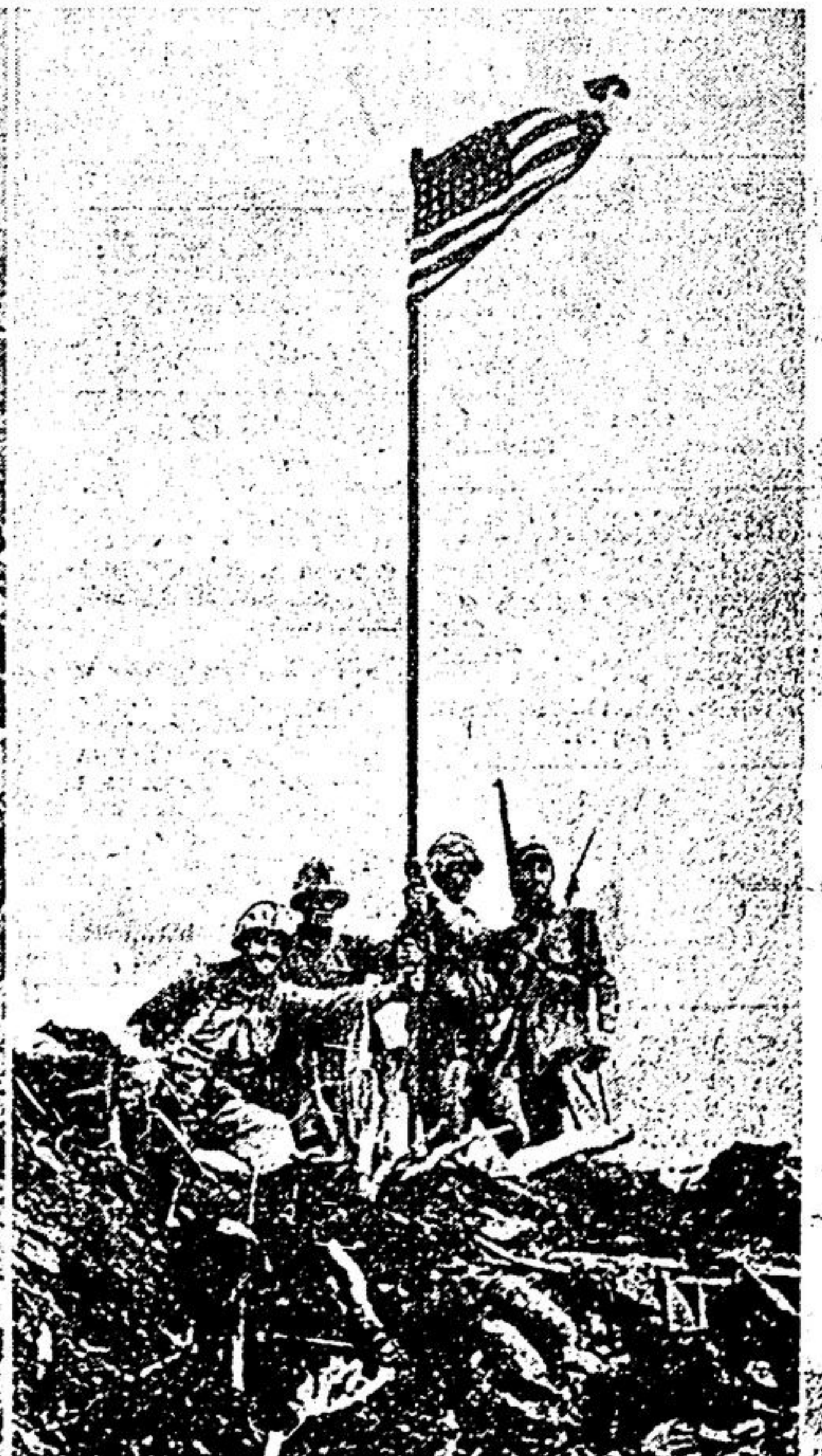
Four men who first raised the flag pose for Burns' camera.