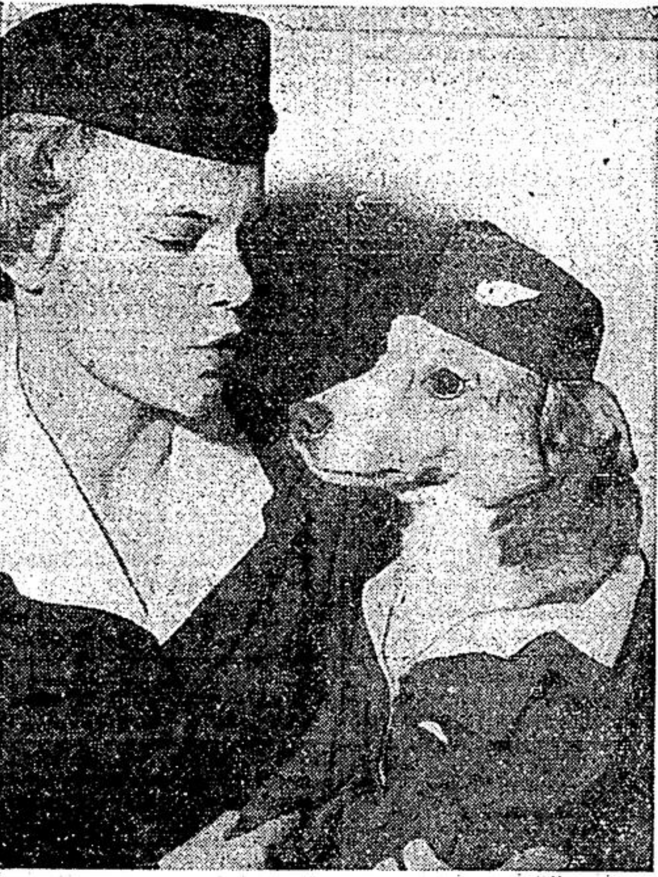
FLIGHT OF FANCY —No airedale, but nonetheless air-minded is Sandy, decked out in a stewardess uniform similar to that worn by Adele Lindeman at Chicago airport. Sandy belongs to an airline employe and is called a sky terrier.