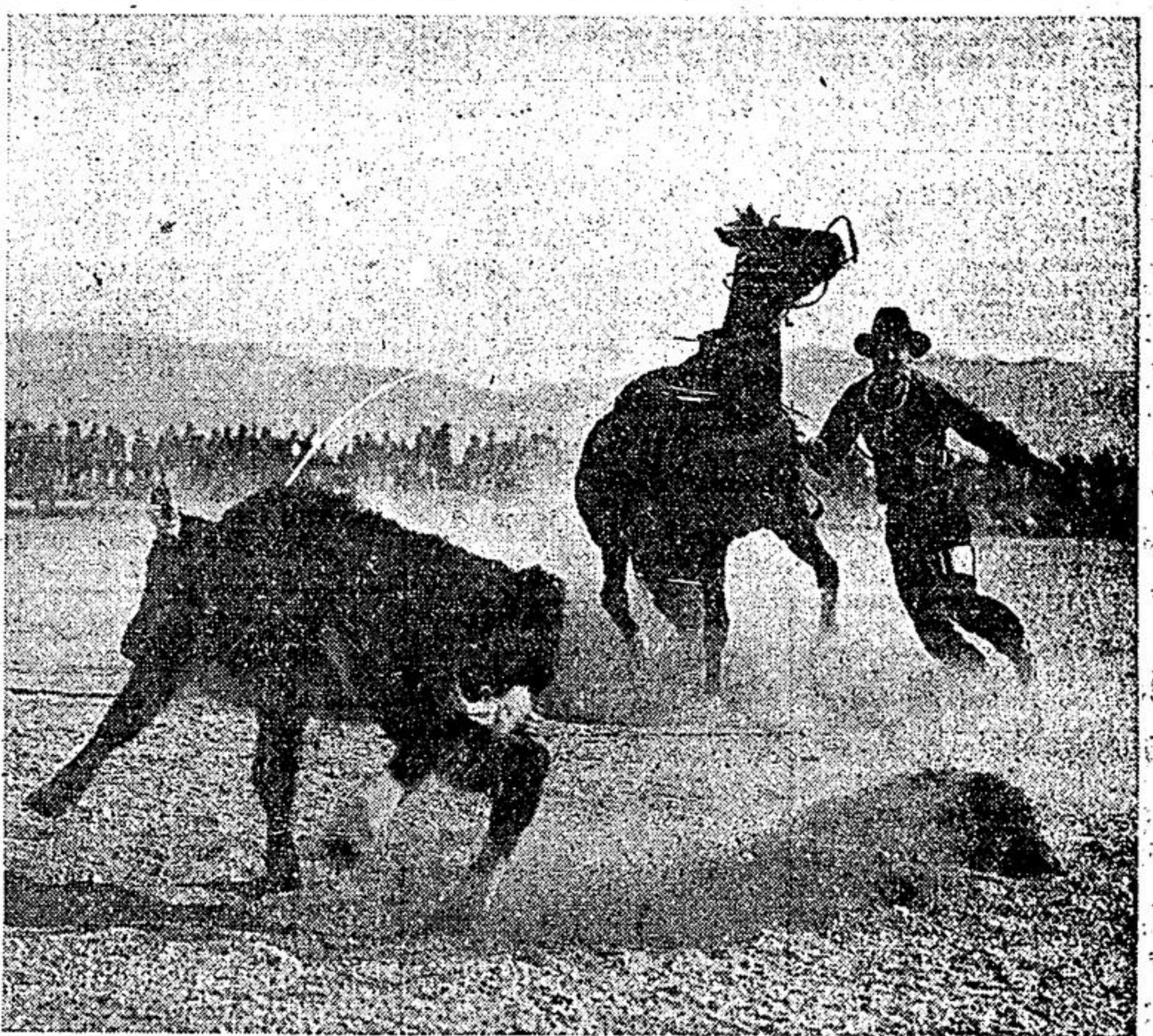
THE FLATTENED CALF —A dismounted cowboy moves in on calf after throwing a loop over him while his horse begins to pull the rope taut at a rodeo held in Tucson, Ariz.