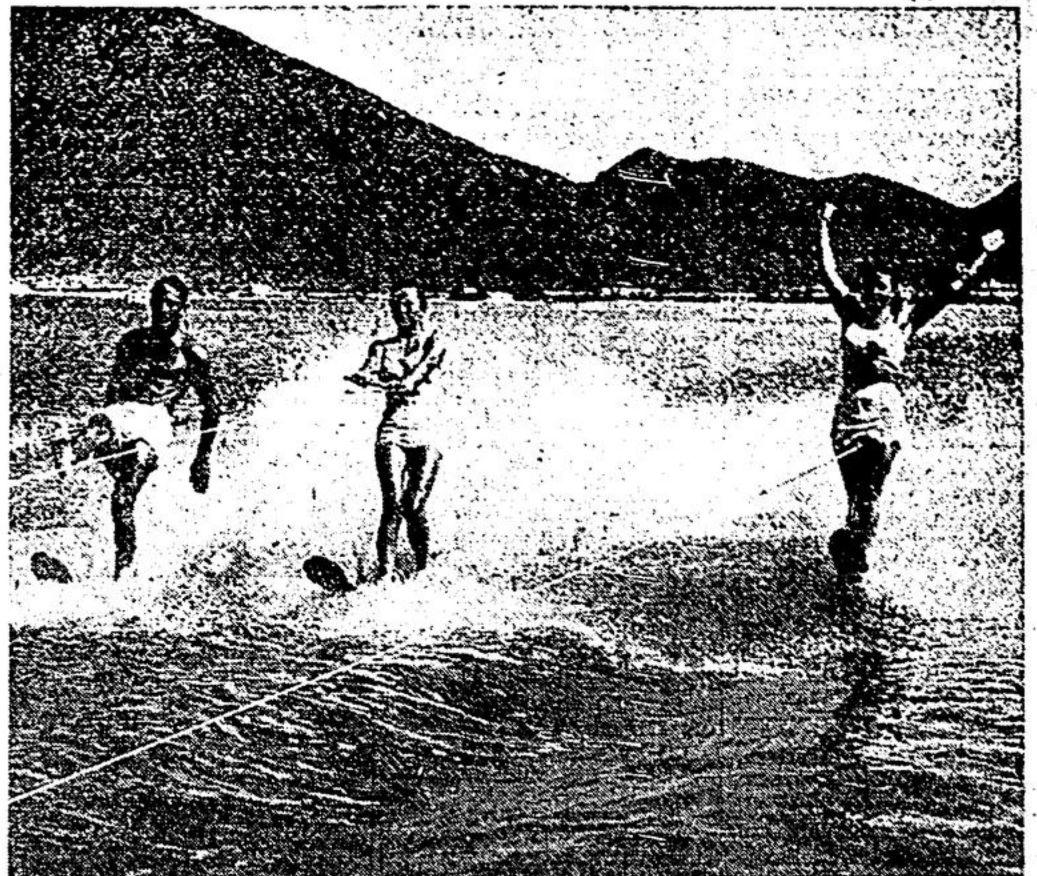
SKI BLUE WATERS —Guests at a swank hotel go skimming over the waters of the Gulf of California, off west coast of Mexico's mainland. Several ex-champs put on a show.