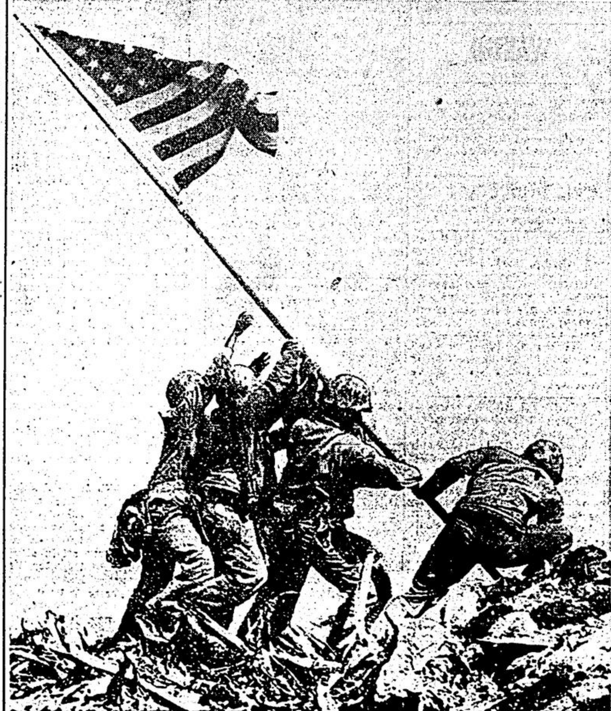
This is the widely-distributed Rosenthal photo of the flag-raising on Mt. Suribachi.