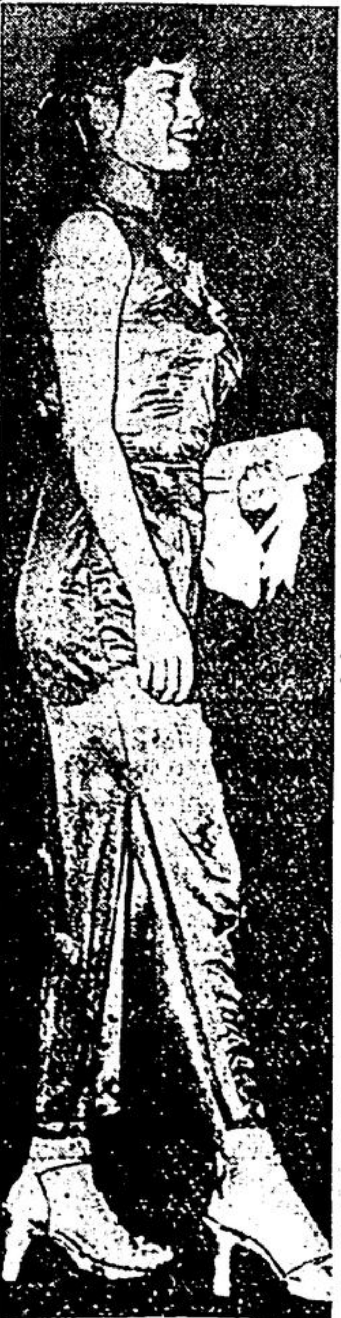
TOPS —Despite the crisis in Formosa, lighter moments find fashion show with a Chinese gown.