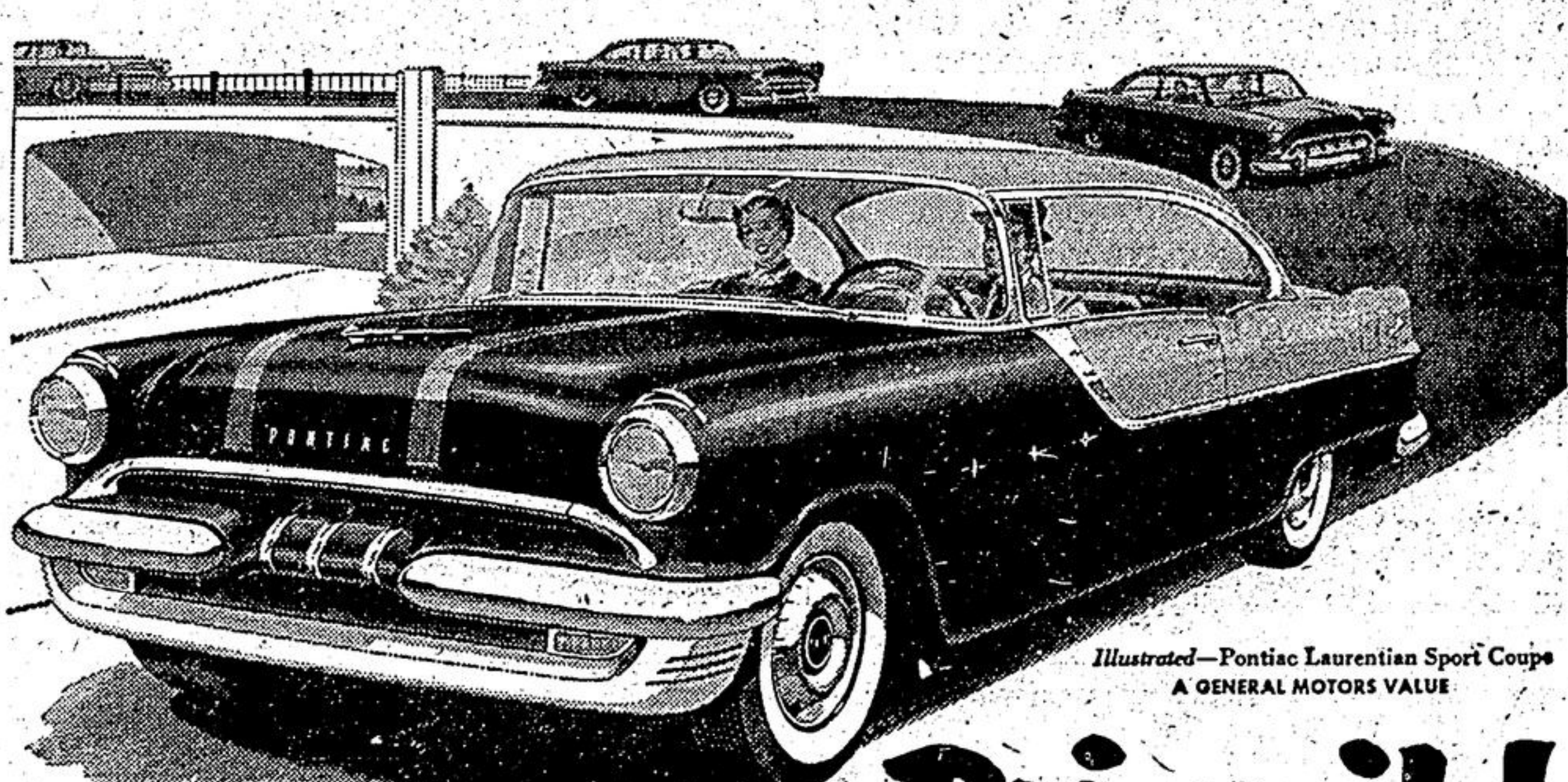
Illustrated—Pontiac Laurentian Sport Coupe A GENERAL MOTORS VALUE